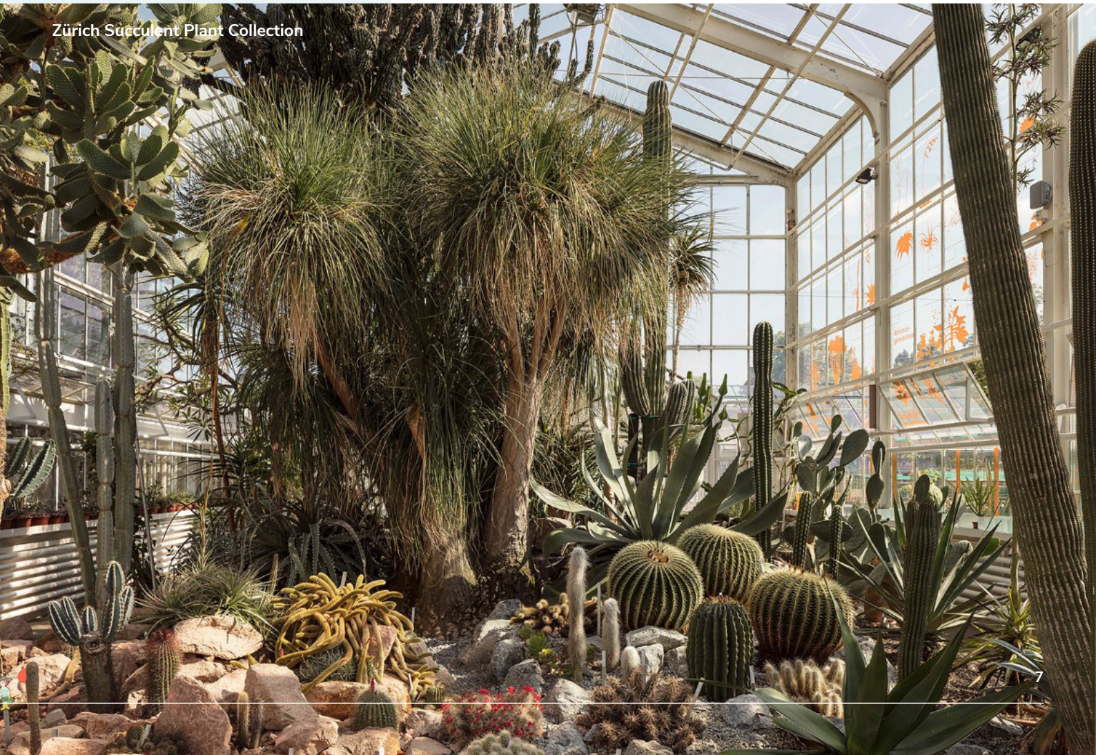
Zürich Succulent Plant Collection