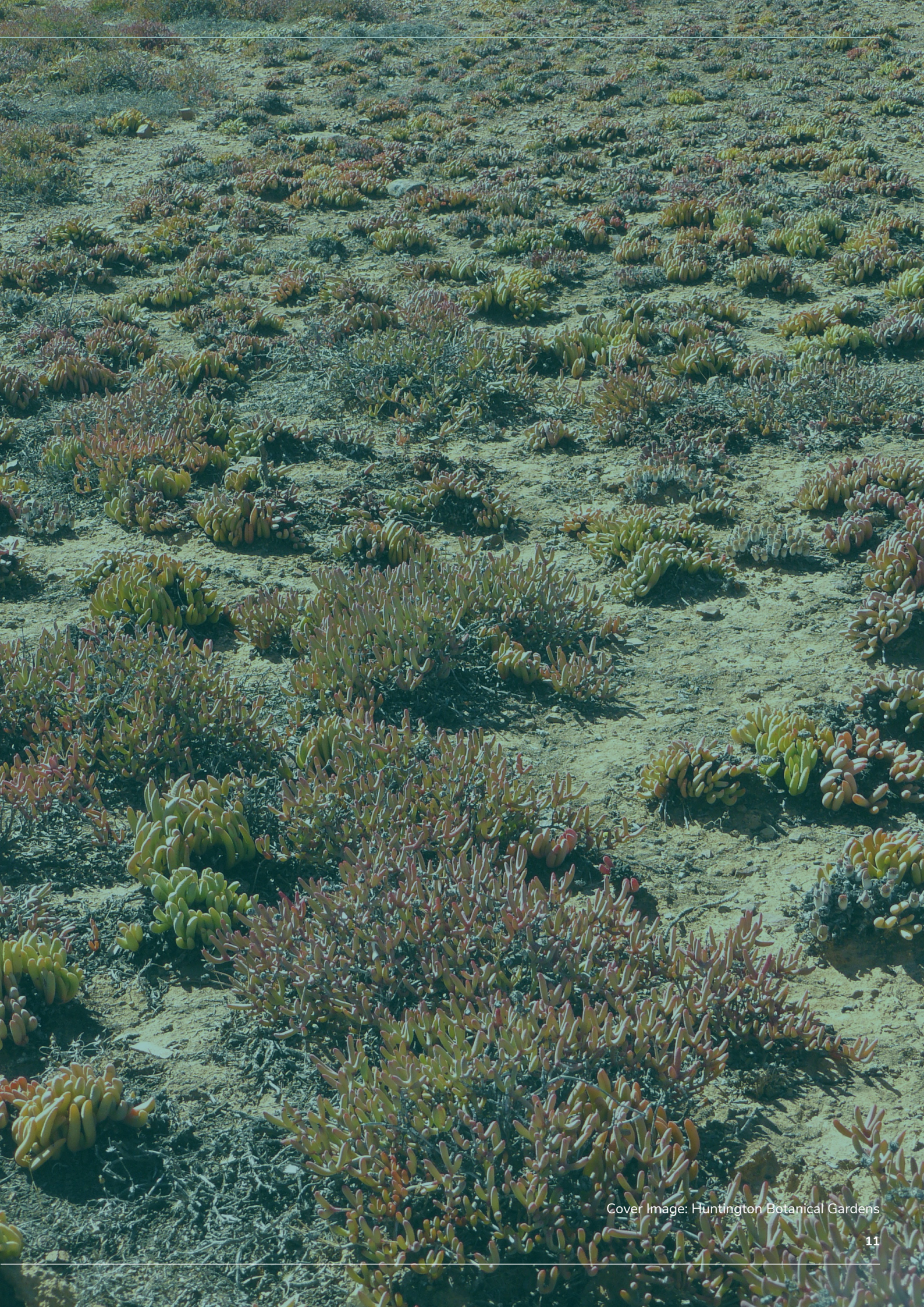
Cover Image: Huntington Botanical Gardens