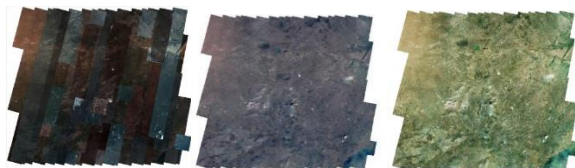
Figure 2 Mosaic uniform color process of K50

Figure 2 is the Mosaic uniform color process of ZY3 satellite image of K50. Figure (a) is the fusion image. Figure (b) is the adjustment of edge effect after GXL-PCI software, and the adjacent images are uniformly over. Figure (c) is to reduce the result of figure (b) to 20m, and the image size is reduced to 3-4GB. Through reference image formed after artificial color mixing, the output of ColorMapping software is used.