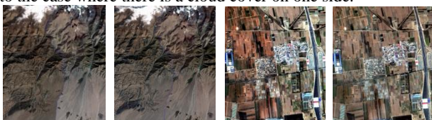
Figure 3 comparison of the dodge point edition

Evasion point refers to the adjacent image mosaic line between random increase points. Realize the local scope of image color consistency through statistical partial overlap area image histogram equalization processing. In the region where the image season is different, the number and density of dodge points can be increased appropriately to achieve uniform color transition between images. In addition, the dodge point can be set to either side changes or side changes, which can be applied to the case where there is a cloud cover on one side.