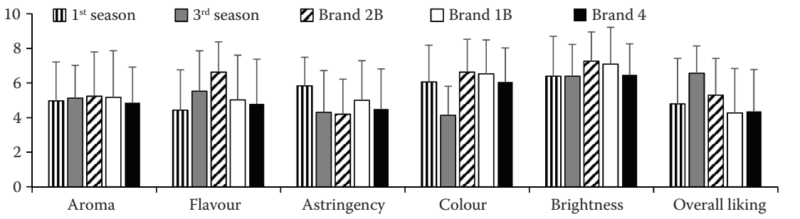
Figure 2. Sensory attributes of MT black teas and commercial Turkish black teas (brand 1B, 2B – best quality tea; brand 4 – standard quality tea)

The linear correlation analysis showed that concentrations of polyphenols (P = 0.019) and theaflavins (P = 0.001) were positively correlated with astrin-