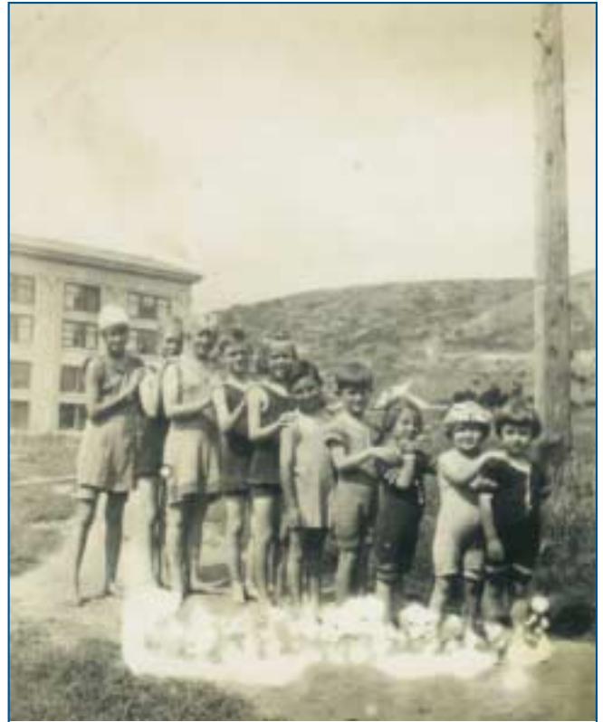
During the 1920s, Scripps was isolated from the city of San Diego, which forced many of those who worked at the institution to live on campus with their families. Shown here are the "Scripps Kids."