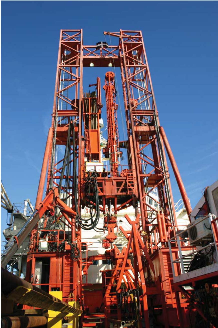
Figure 3. The piggy-back drilling system employed on the DP Hunter . The API drillstring is run to the seabed so that the rooster box (a platform suspended above the deck) becomes heave compensated (i.e., it does not move up and down with ship motion). Using the mining rig that is located on the rooster box, a narrower drillpipe is then lowered inside the API pipe and is used to recover the core. As the mining rig is heave compensated, it can obtain high-quality cores even in significant swell conditions. Excellent downhole log data were also obtained by running the tools from the rooster box.

glaciation when insolation, sea level, and atmospheric CO 2 levels were different from today.