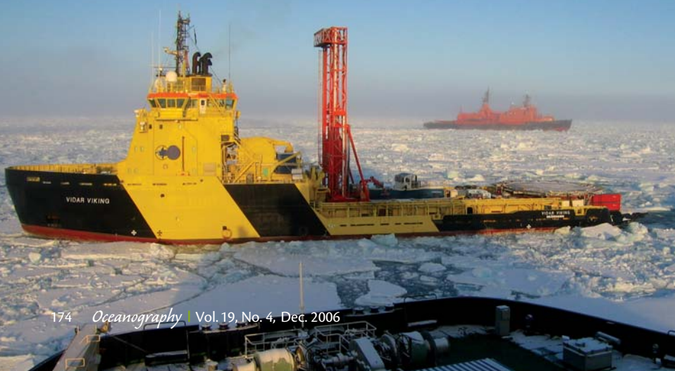
Figure 1. The Vidar Viking drilling in the Arctic ice, with the Russian nuclear icebreaker Sovetskiy Soyuz in the distance. Photo taken from the Oden.