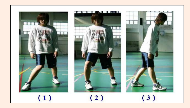
Figure 2. Classification of the dynamic alignment at the time of the injury: We classified the dynamic alignment into six categories: (1) Knee-in & Toe-out: Dynamic alignment with the valgus position of the knee and the abduction position of the foot during the loading phase, (2) Knee-out & Toe-in: Dynamic alignment with the varus position of the knee and the abduction position of the foot during the loading phase, (3) Hyperextension: Dynamic alignment with the hyper-extended position of the knee during the loading phase, (4) Unclear, (5) Unknown, and (6) Other.