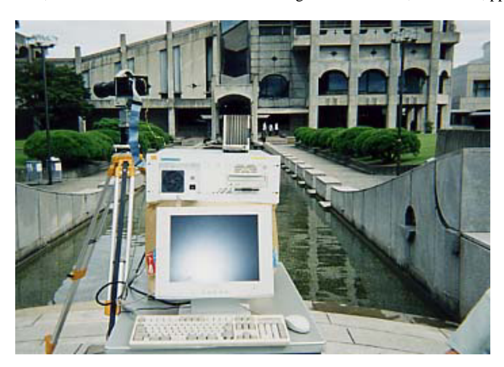
Figure 4. Experiment executed in Kanazawa Institute of Technology

Hosomura, T., 2001. 3D Modeling of Earthenware by Using Video Camera. Proc. of International Workshop on Recreating the Past –Visualization and Animation of Cultural Heritage- Ayutthaya, Thailand, Vol. XXXIV, Part 5/W1, pp. 141-142.