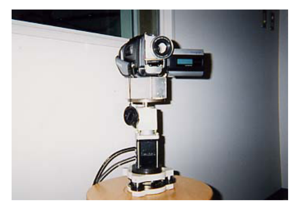
Figure 1. Video camera system used in this study