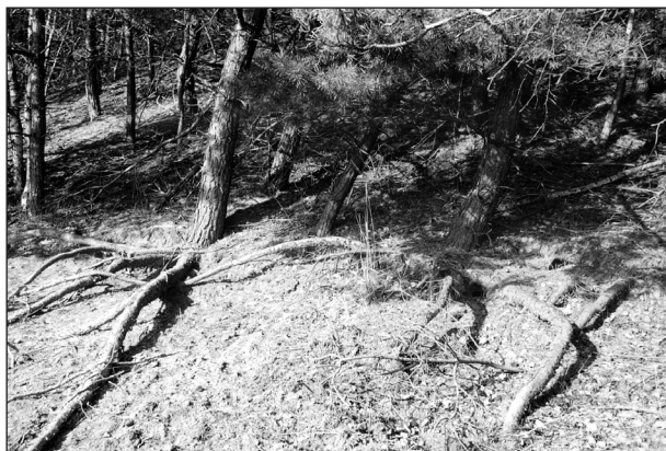
Fig. 3. The initial stage of Pinus sylvestris L. windfall (the static load of the set of horizontal roots is not in correlation with the developing aboveground part)

lematic from the aspect of nutrition; here the high content of manganese was determined in assimilation organs (the Mn:Fe ratio is quite unsuitable), except for Pinus sylvestris L. and Fraxinus excelsior L., of which a higher content of Fe is typical. The determined condition of evaluated woody plants may however be influenced to a different extent: by the heterogeneity of soils used for the dumpsite overlaying – sugar-factory sludge, spoil, strippings of Cambisol humus horizons in an opencast mine before the extraction started, by the character of the root system contact with deposited sludge and apparently also by different adaptability of tree spe-