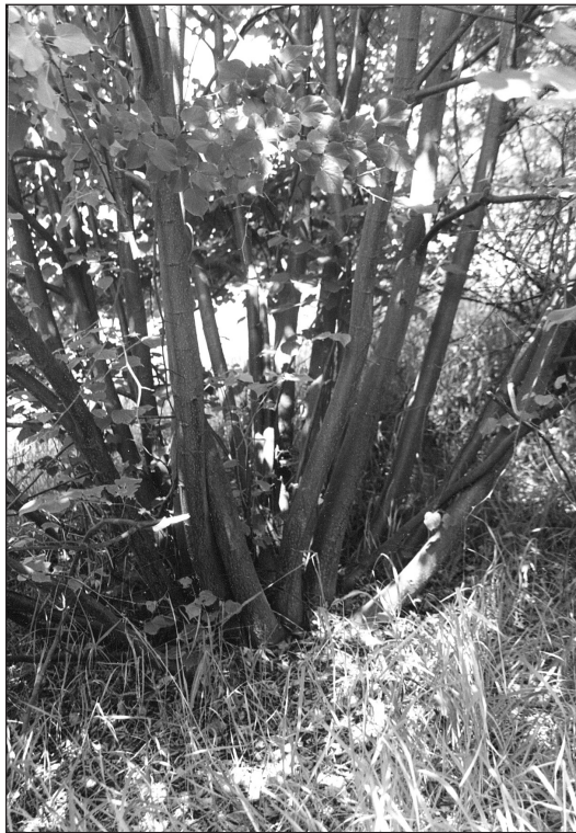
Fig. 1. Multiple trunks ( Tilia cordata Mill.), frequent state of development also in Betula verrucosa Ehrh., Acer pseudoplatanus L., Fraxinus excelsior L., Sorbus aucuparia L.