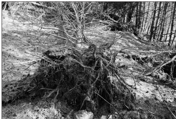
Fig. 2. The state of the root system of Pinus sylvestris L. in the slope part of dump (taproot – twin root is not developed)