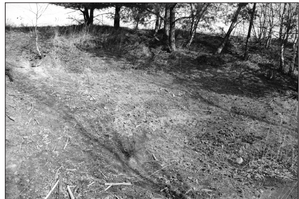
Fig. 5. The vegetation state characteristic of the dump surface damaged by water erosion with surface occurrence of deposited industrial waste