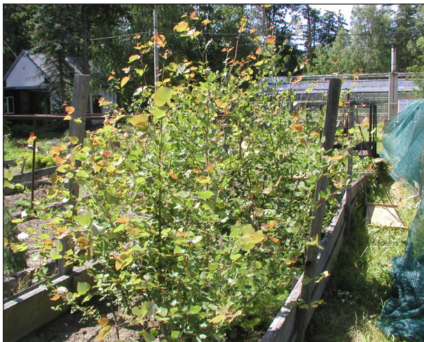
Fig. 3. Plantlets of aspen growing on nursery beds

For its regeneration ability aspen is a very promising woody species for genetic engineering. Hybrid aspen No. 5 from the Gene Bank of For-