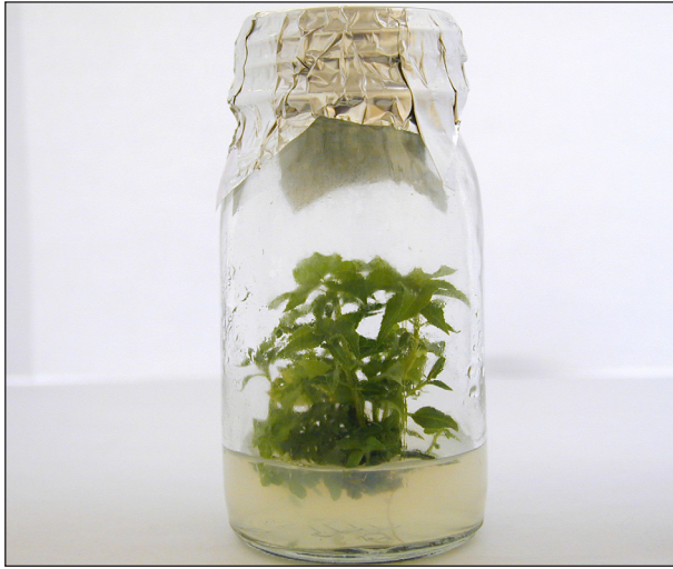
Fig. 1. Multiplication of aspen explants