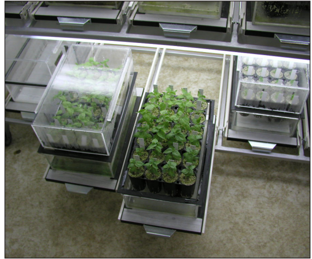
Fig. 2. Acclimatization of aspen plantlets

climatization the losses were minimal – around 2% (Fig. 2). The plantlets grow on the outside bed of the experimental nursery (Fig. 3).