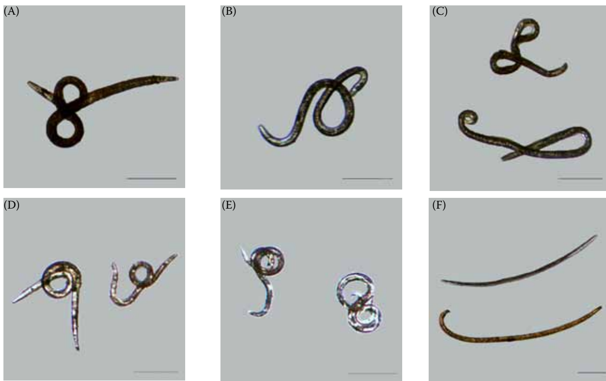
Figure 2. Shape of B. xylophilus following exposure to copper sulphate observed under an inverted microscope (bars = 100 \mu\text{m} )

(2.5 \mu\text{mol/l} ) was detected and body bending was used as an assay to evaluate the toxicity from all assayed heavy metal exposures at different concentrations (WANG & XING 2008). In the present study, movement-related behaviours, including body shrinking and head movement, of B. xylophilus exposed to chemicals for different durations was monitored. We observed that the nematodes slowed down abruptly when they were initially placed in different concentrations of copper sulphate, which may be due to sudden stimulation by copper sulphate, and this was followed by recovery within several minutes.