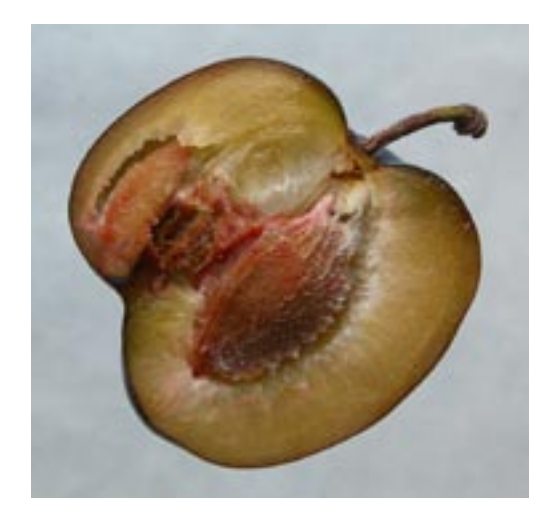
Figure 5. Cross section through spured fruit of plum

Peach trees which were well watered during August and September had significantly fewer fruit doubles than trees which were under stress during those months. Growers reported increased