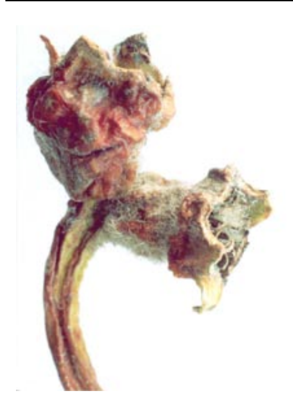
Figure 8. Fruit doubles of apple. Both fruits were smaller than normal, and their development remained retarded

problems with fruit doubles, providing further evidence to support the critical need for timely irrigation in successful peach production (JOHN-SON et al. 1992; STRIEGLER 2000).