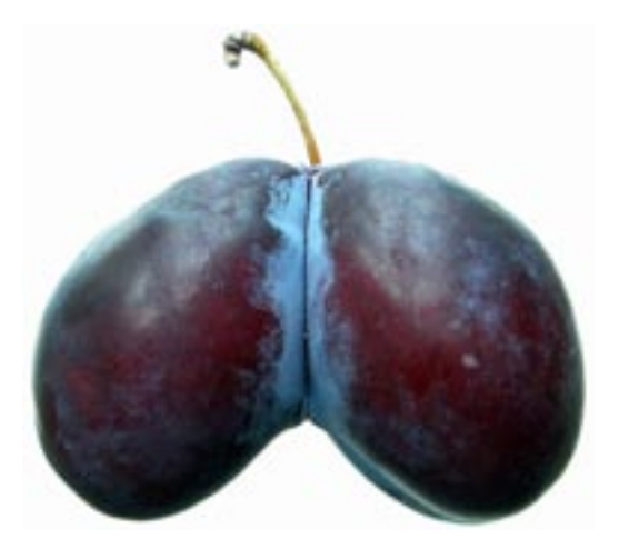
Figure 2. Fruit doubles of plum