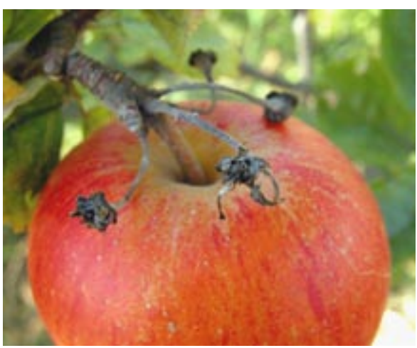
Figure 7. Apples spur with fully developed terminal fruit while basal fruits are retarded