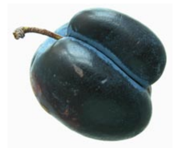
Figure 4. Spured fruit of plum