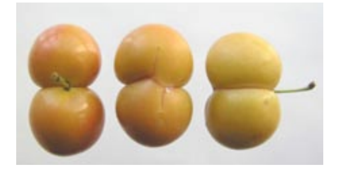
Figure 6. Fruit doubles of mirabelle

Peach trees which were well watered during August and September had significantly fewer fruit doubles than trees which were under stress during those months. Growers reported increased