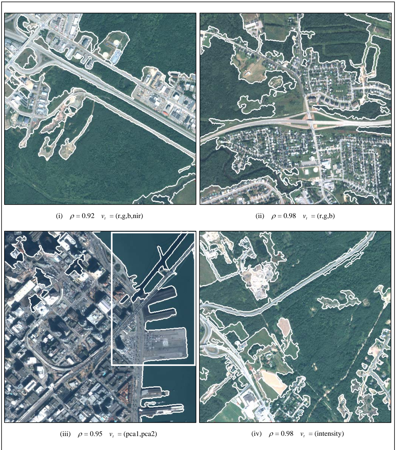
Figure 3. Region-based Segmentation of QuickBird 2.44m MS Imagery through Fuzzy Integration: (i) segmentation of an urban scene using all available multispectral bands, (ii) segmentation of an urban scene using only color (r,g,b), (iii) segmentation of downtown San Francisco using principle components 1 and 2. (The rectangle applied on this image relates to the information in Figure 4) and (iv) segmentation of an urban scene using only intensity.