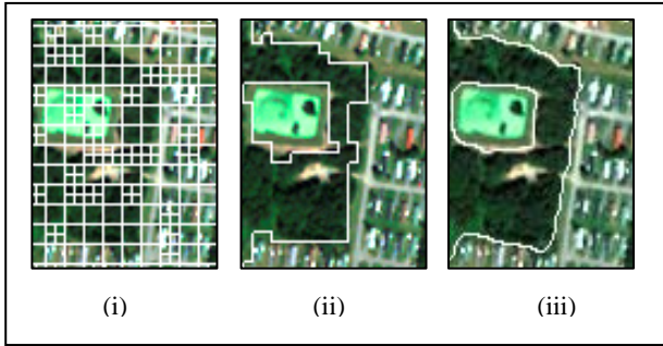
Figure 1. The three essential HSMR processes: (i) Hierarchical Splitting, (ii) Agglomerative Merging, and (ii) Localized Pixel Refinement.

framework performs a three-step process of: i) splitting, ii) merging, and iii) refining image segments. For a more complete description of these processes, readers can refer to Ojala and Pietikainen 1999. The HSMR algorithmic framework is dependent on a method of describing and comparing image regions. In this approach the methods developed by Wuest and Zhang 2008 for region description and comparison are employed for HSMR integration.