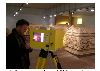
Figure 1. Laser scanning of Sidamara's grave by Optech Ilris 3D

The object dimensions are 2.5mx1.3mx1.5m (lxwxh) approximately and, it has been detailed with figure demonstrate human and animal on the object. Laser scanning was acquisitioned from four stand positions.