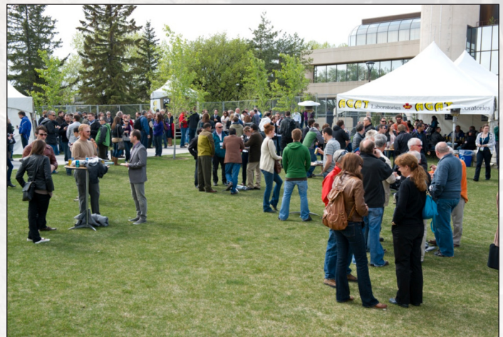
Core meltdown in progress