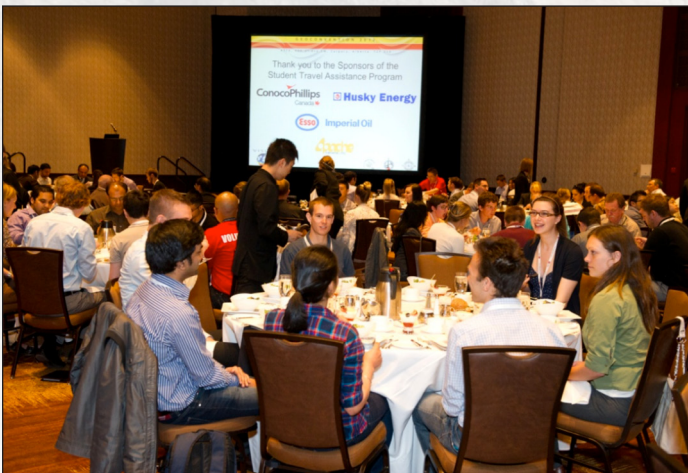
Luncheon for the Industry–student mixer