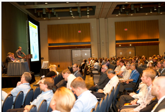
A technical session in progress at the 2012 GeoConvention

Along with Exhibits, the Sponsorship Committee also exceeded budgeted revenues. In 2012 this committee worked to develop new opportunities to better fit the needs of industry partners, and expanded the advertising opportunities available. Some key successes: