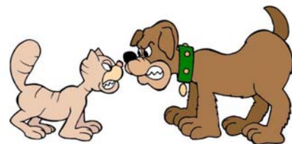
Figure 3: Sample Conjoined Noun Phrase item from Experiment 2.

Secondly, as discussed previously, much prior research on sentence production and linguistic choice has compared the role of many different factors, from animacy to size of entities, on differing constructions. Specifically, different variables seem to contribute differently to linguistic choice in simple conjoined noun phrases (e.g. the dog and the man vs. the man and the dog ) than to linguistic choices involving thematic role assignment (e.g. the dog chased the man vs. the man fled the dog ). In Experiment 2, we wanted not just to replicate our prior result, but also to compare the influence of our covert attention-capture manipulation on these sorts of different constructions. To this end, twelve additional items were added in Experiment 2, depicting events in which two scene participants were engaging in an activity together (see Figure 3, designed to elicit “The cat/dog and the dog/cat are growling at each other”). These Conjoined Noun Phrase (CNP) items were aimed at eliciting descriptions containing a conjoined noun phrase in the sentential subject position (e.g. A dog and a cat are growling), so as to investigate the effect of our covert manipulation on word order in a simple conjoined noun phrase.