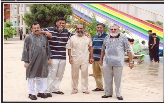
Our Members at the picnic spot

Members' Affairs Committee of the Karachi Branch Council organized a picnic for members and their families at Water World near Gadap Town, Dumba Goth, Super Highway, Karachi on Sunday 22 nd July 2007. The members and their families enjoyed the picnic and showed great interest for such events in the future.