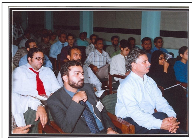
Participants during Seminar

More than 100 participants including Cost and Managements Accountants, Chartered Accountants, Bankers, Insurers, Business Managers, Senior Executives, Representatives from Tertiary and Manufacturing Sectors, Chambers of Commerce & Industries and members of other Business Community attended the Seminar.