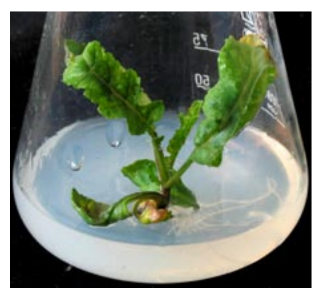
Figure 5. Plant regenerated from the protoplast derived callus in B. oleracea developing roots

or MS without growth regulators. Medium E is essential for the induction of shoot regeneration in developing calli. The shoots were transferred to half-strength MS medium for rooting and for prevention of vitrification (Figure 5). In B. oleracea all the developed shoots regenerated into whole plants whereas in B. napus the plant regeneration efficiency was 45–50%.