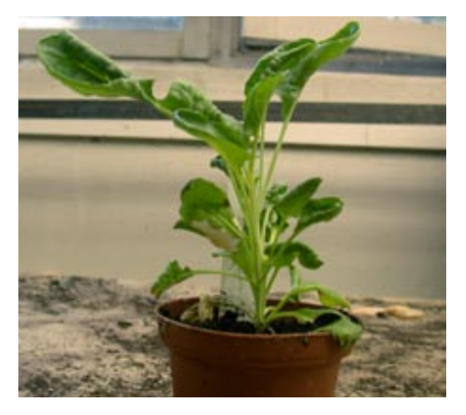
Figure 6. B. oleracea abnormal plant bearing curly leaves

The regeneration of plants from protoplasts is a prerequisite for their utilization in crop improve-