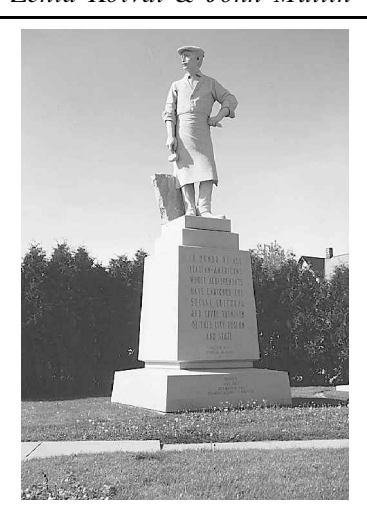
FIGURE 2. The Stonecutter's Monument, Main Street, Barre, Vermont.

vocational school, the community college and the Private Industries Council (PIC), the results in Barre are unsatisfactory. The granite industry, like most other industries in the US, wants entry-level workers with good basic skills. The firms will train them in the particular company-established methods; the industry has a substantial lack of confidence in higher education.