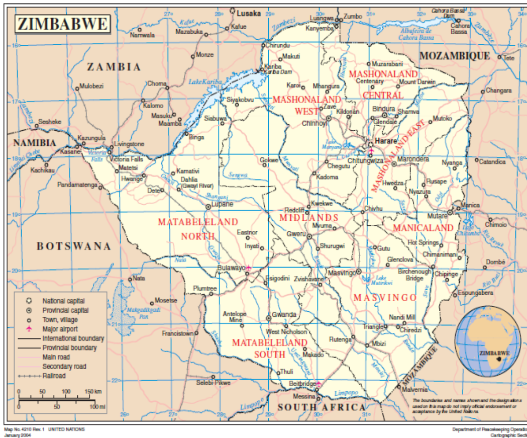
Fig.1 Administrative Map of Zimbabwe.

Zimbabwe can also be described in terms of provinces, which are politically administered by appointed Governors and publicly-appointed Resident Ministers whose primary responsibility is to develop the province and serve the people within those provinces. As shown in Figure 1 below, there are 8 provinces 8 in Zimbabwe.