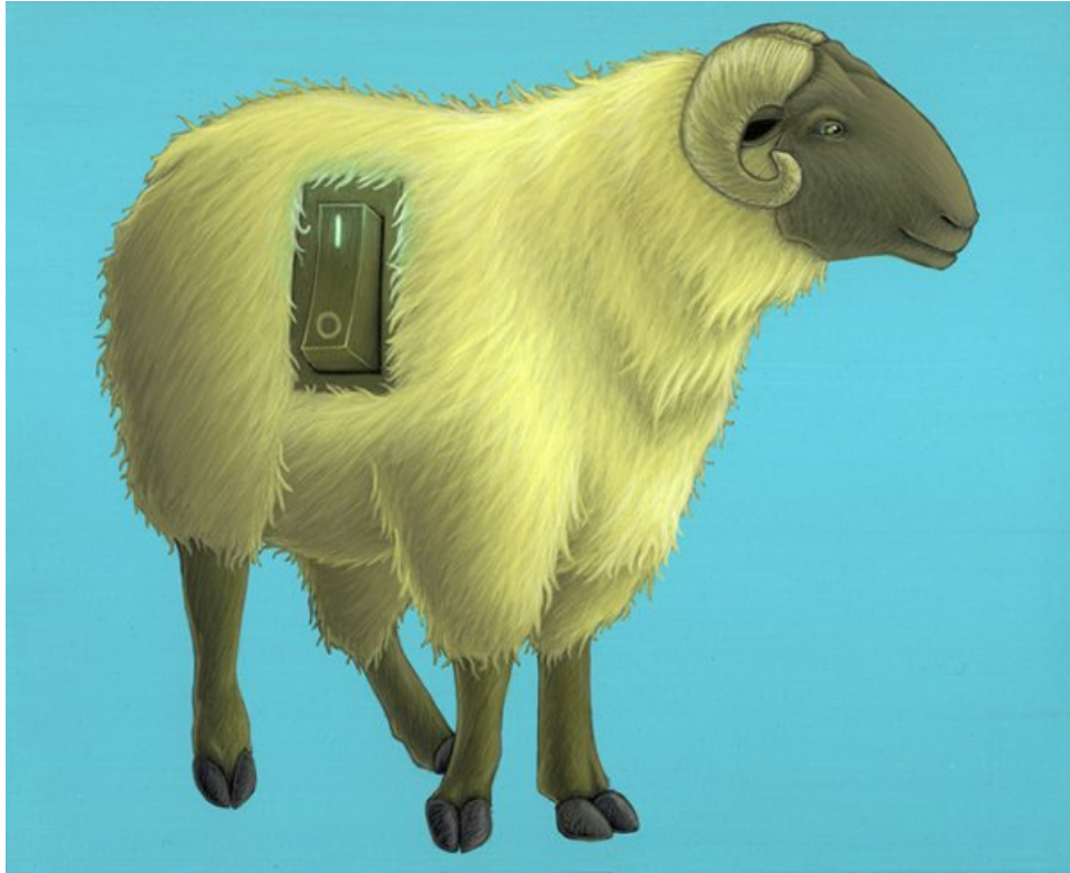
Figure 5: "On", "8"x10", Acrylic, 2012