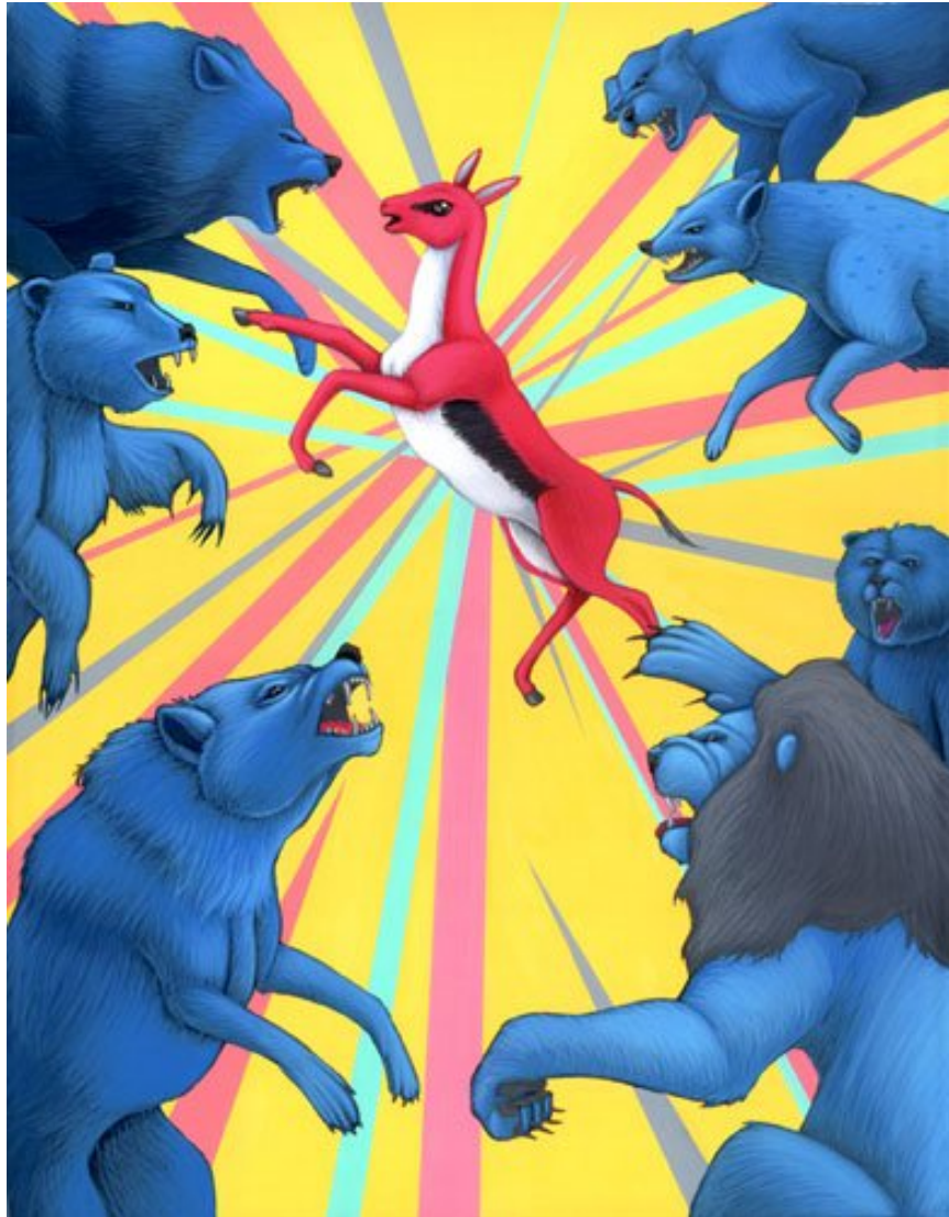
Figure 1: "25/F/CA Looking For Love", 9"x12" Acrylic, 2011