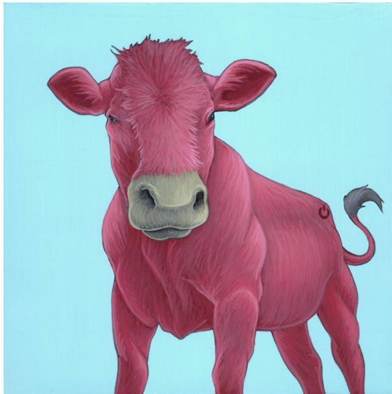
Figure 8: "Branded", 8"x8", Acrylic, 2012