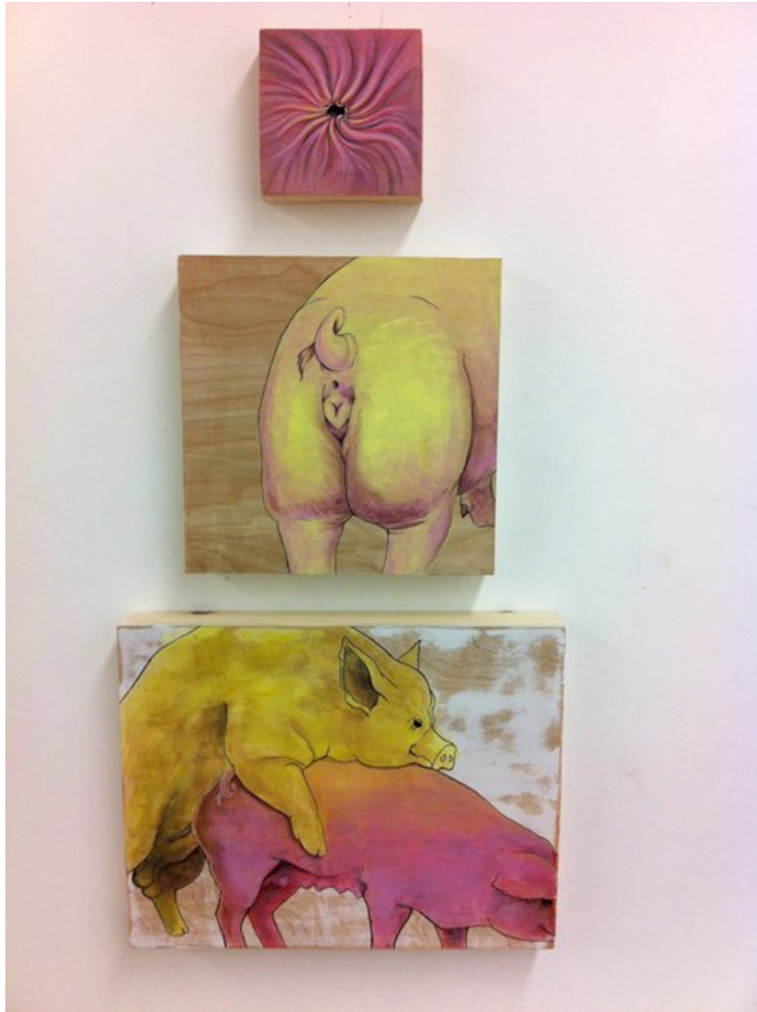
Figure 9: "Hole", 14"x 28" Acrylic, 2013