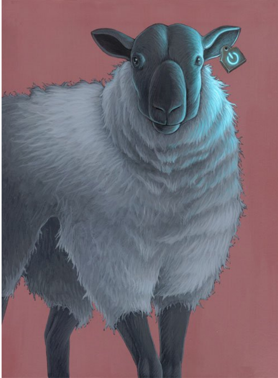
Figure 4: "Plugged In", 9"x 12", Acrylic, 2012