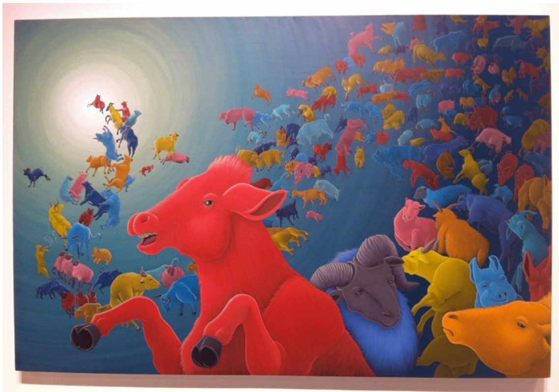
Figure 11: "The Humans", 4'x6', Acrylic, 2013