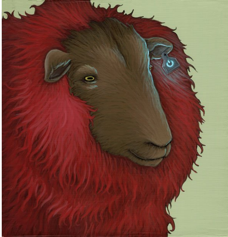
Figure 7: "Power On", 8"x8", Acrylic, 2012