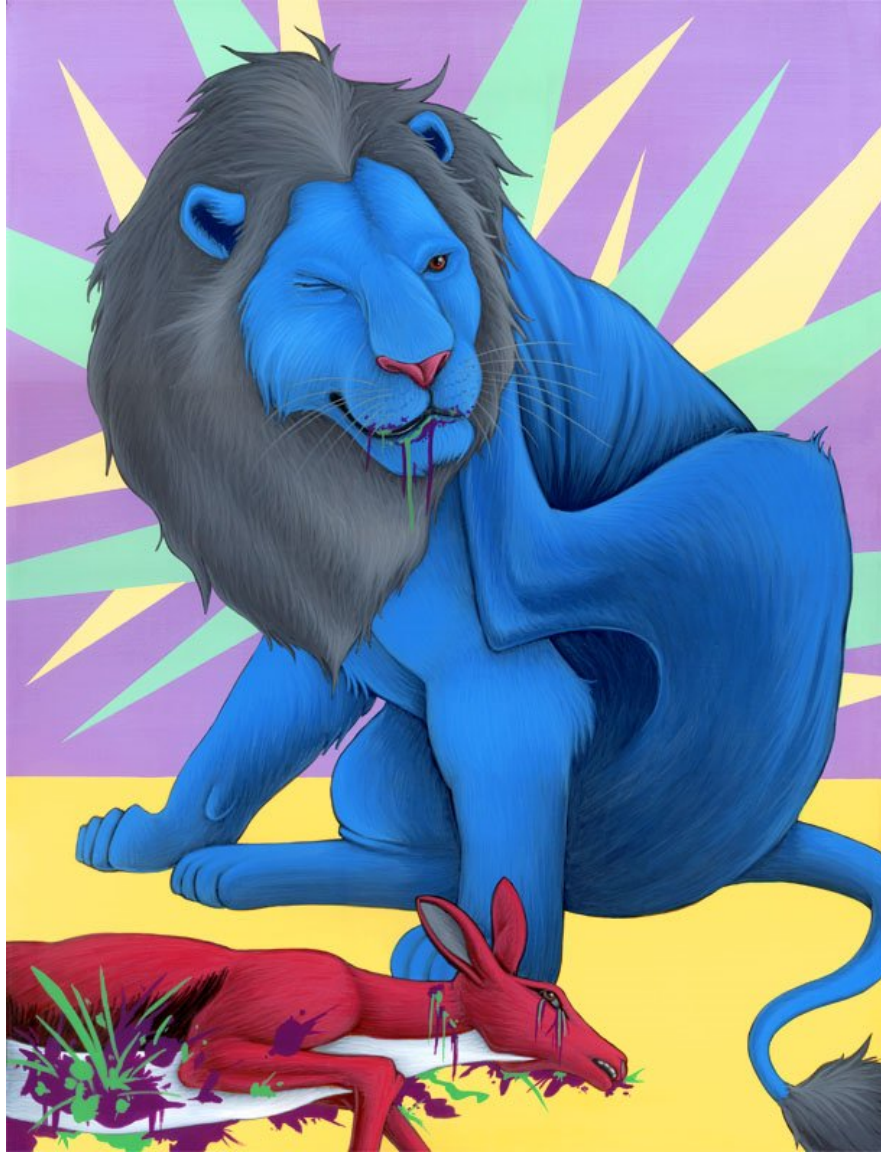
Figure 2: "He Seemed Nice", 18"x24" Acrylic, 2011