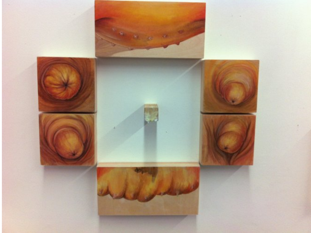
Figure 10: "Nipples", 20"x20", Acrylic, 2013