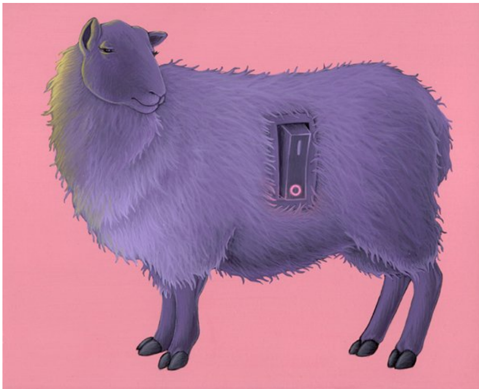
Figure 6: "Off", 8"x10", Acrylic, 2012