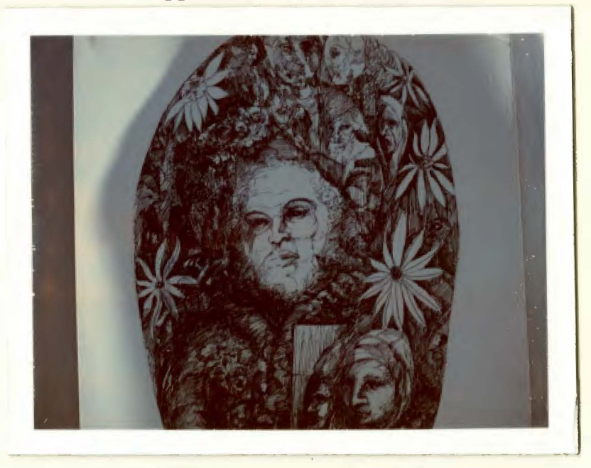
Appendix 2. Page 3