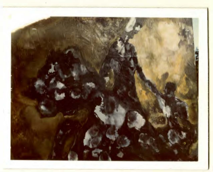
Figure 10 intends the complimentary color scheme to carry the major contribution, via psychological shock, but adds figure distortion to attract the eye. This