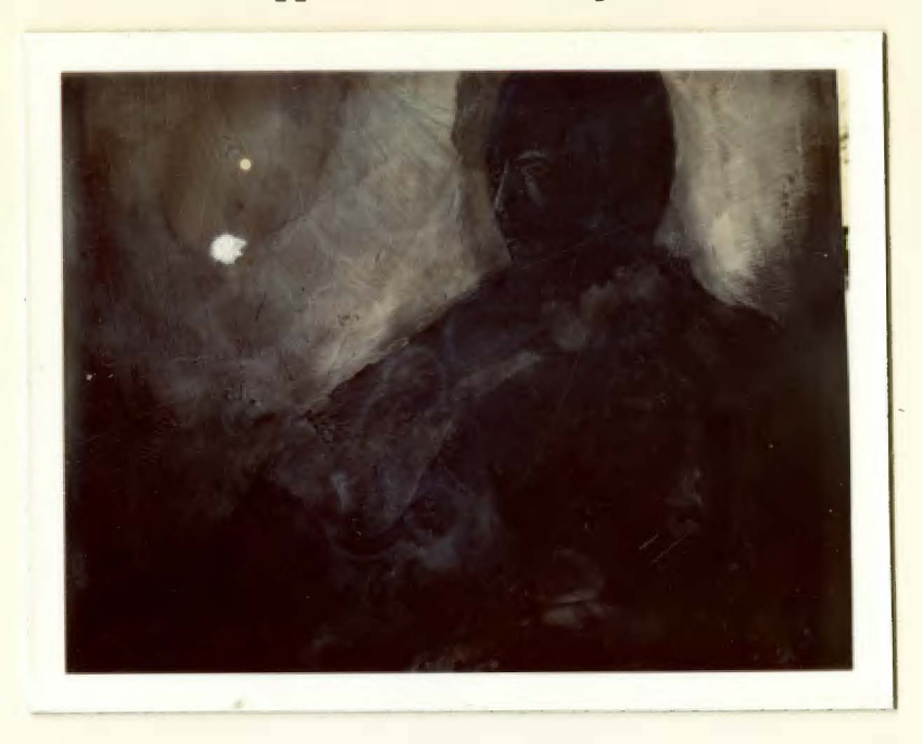
Appendix 4. Page 9