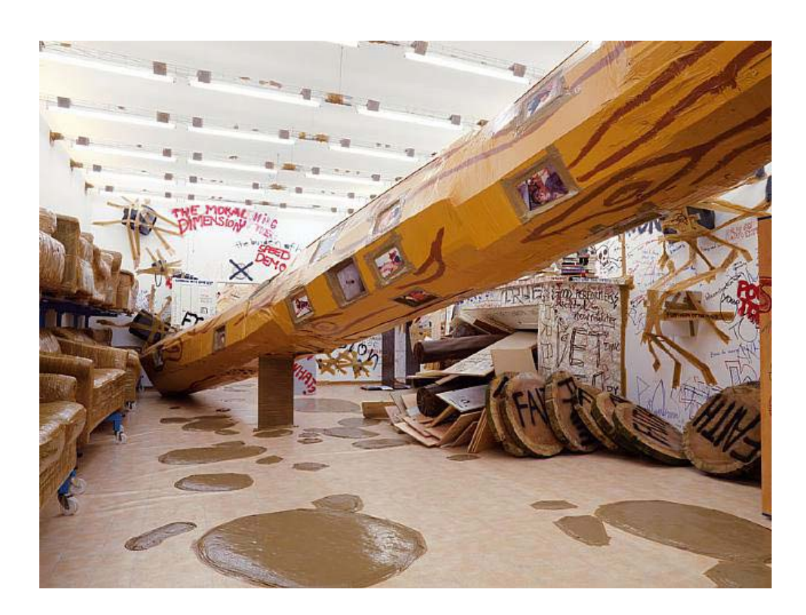
Figure 3: Thomas Hirschhorn, Stand-Alone, 2007

Hirschhorn is able to use the gallery space but still walk the line of painting, collage, construction and sculpture that Kaprow discusses, using what Hirschhorn himself calls "cheap tricks and stupid things" to jokingly jab the shoulder of hegemonic relationships.