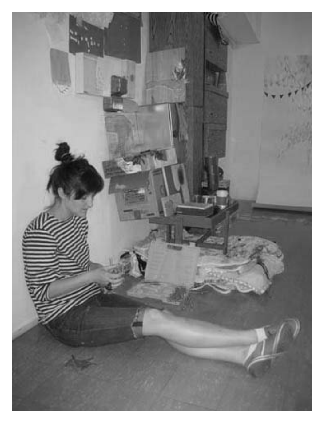
Figure 9: Photo of the artist at work