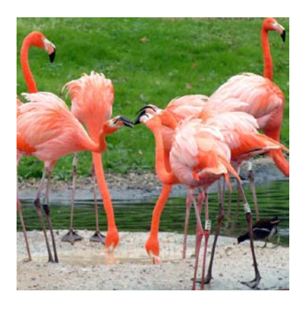
Figure 5: Real Flamingos

The diversity of these connotations is what is important. Somehow, pink became my neutral.