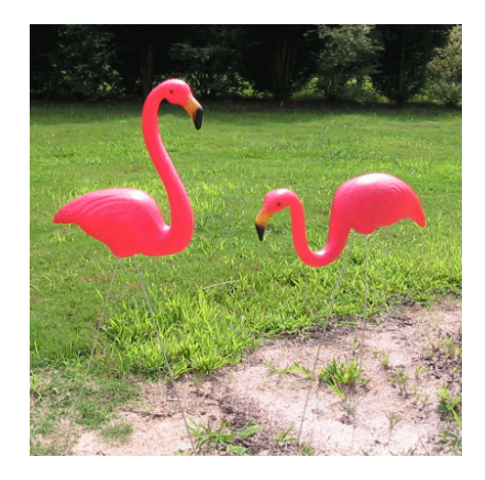
Figure 6: Fake Flamingos