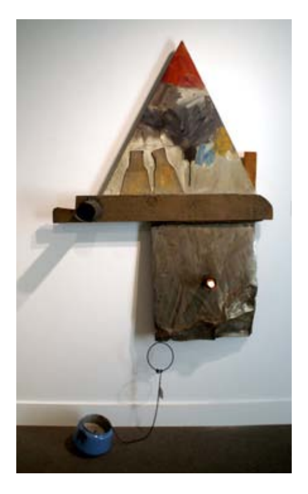
Figure 4: Robert Rauschenberg, Slug, 1961

Likewise, my collection of components used in BANG! was curated with the hopes of imparting multivalent meaning without losing my specific hand. In addition, last-minute intuition is important here – having all of the pieces of the work in boxes the day before the show opens adds to unpredictability of the installation portion. This unpredictability gives me a lot of pleasure. There is always some level of planning, of course, but the broader the materials and the more open I keep my ideas about how things might end up, the more successful I feel.