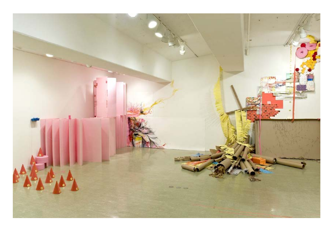
Figure 1: Image from BANG!

disarray and then suddenly organized into rows; some objects are perfect for the job and some seem like place-holders. Corners are filled. However it gets done, the need is clear - I'm here and I have to spread out.