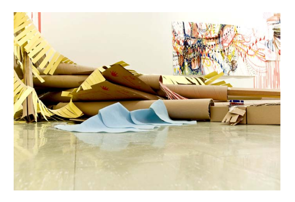
Figure 7: Image from BANG!

Contradiction is again at play. Beauty and its opponent are strengthened by each other. "The sublime moves ... Beauty charms ." "xxiii"