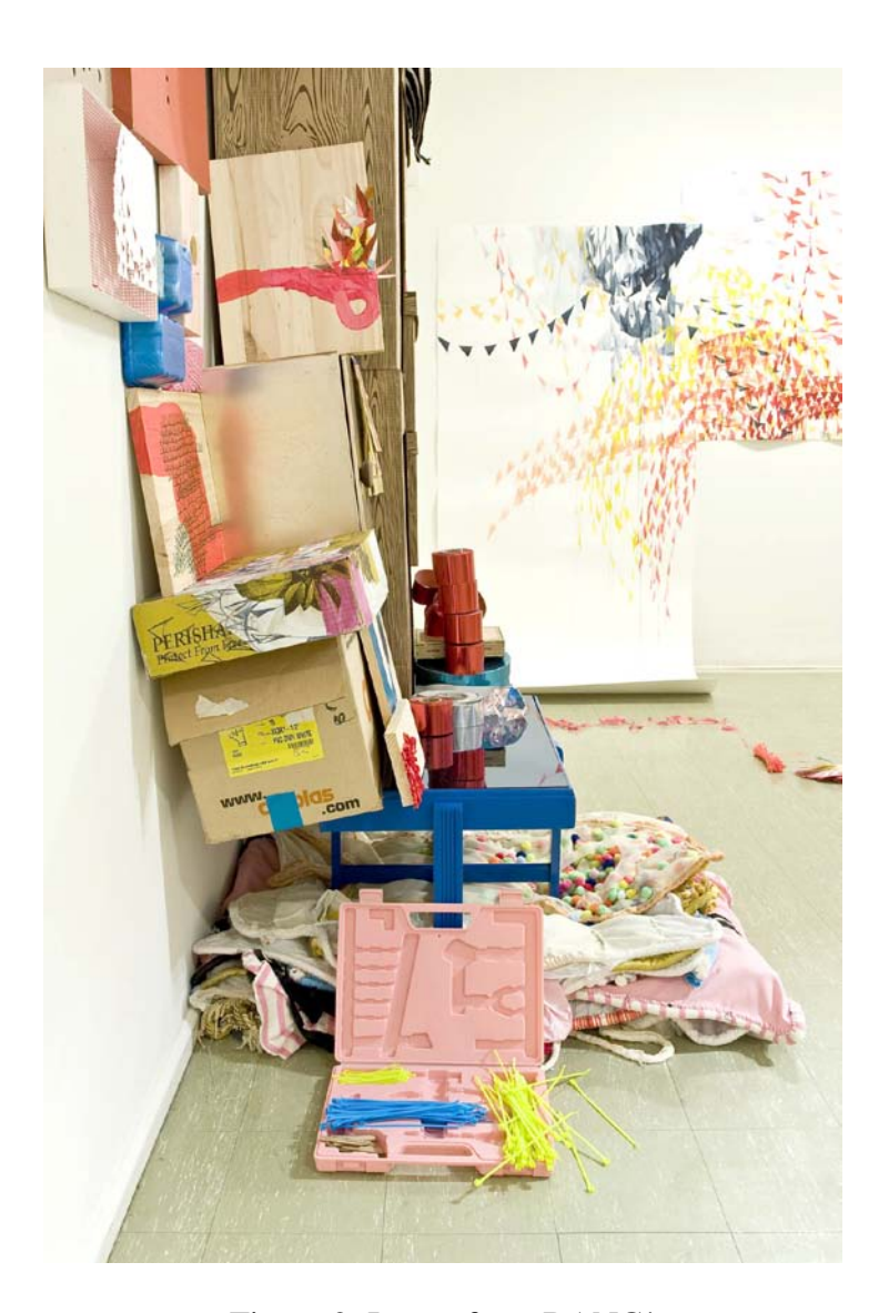
Figure 2: Image from BANG!

My definition of drawing includes the sculptural building and patching-together-of-objects involved in the installation portions of BANG! Edges are aligned and associated with each other to create what is essentially a drawn line, spreading across the floor and up the walls. While three-dimensional and physical, this act of collecting and rearranging many objects is as connected to the idea of quickness as the hurried marks I make with pencil.