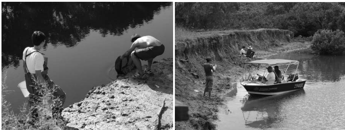
Fig. 2 Field works at Eprapah Creek on 4 April 2003 Left : Fish sampling. Right : Site 2, looking downstream

For measurements from the bank, the data accuracy was about 1 cm for water level elevation, 0.2 to 0.5 °C for water temperature, 1 to 2% for conductivity, 0.2 to 0.5 for pH measurement with pH paper, 5 cm on turbidity Secchi disk length, 10% on the surface velocity and 5 to 10% on the dissolved oxygen concentration. With the water quality probe YSI6920, the data accuracy was : \pm 2\% of saturation concentration for D.O., \pm 0.5\% for conductivity, \pm 0.15^\circ\text{C} for temperature, \pm 0.2 unit for pH, \pm 0.02 m for depth, \pm 1\% of reading for salinity, and \pm 5\% for turbidity.