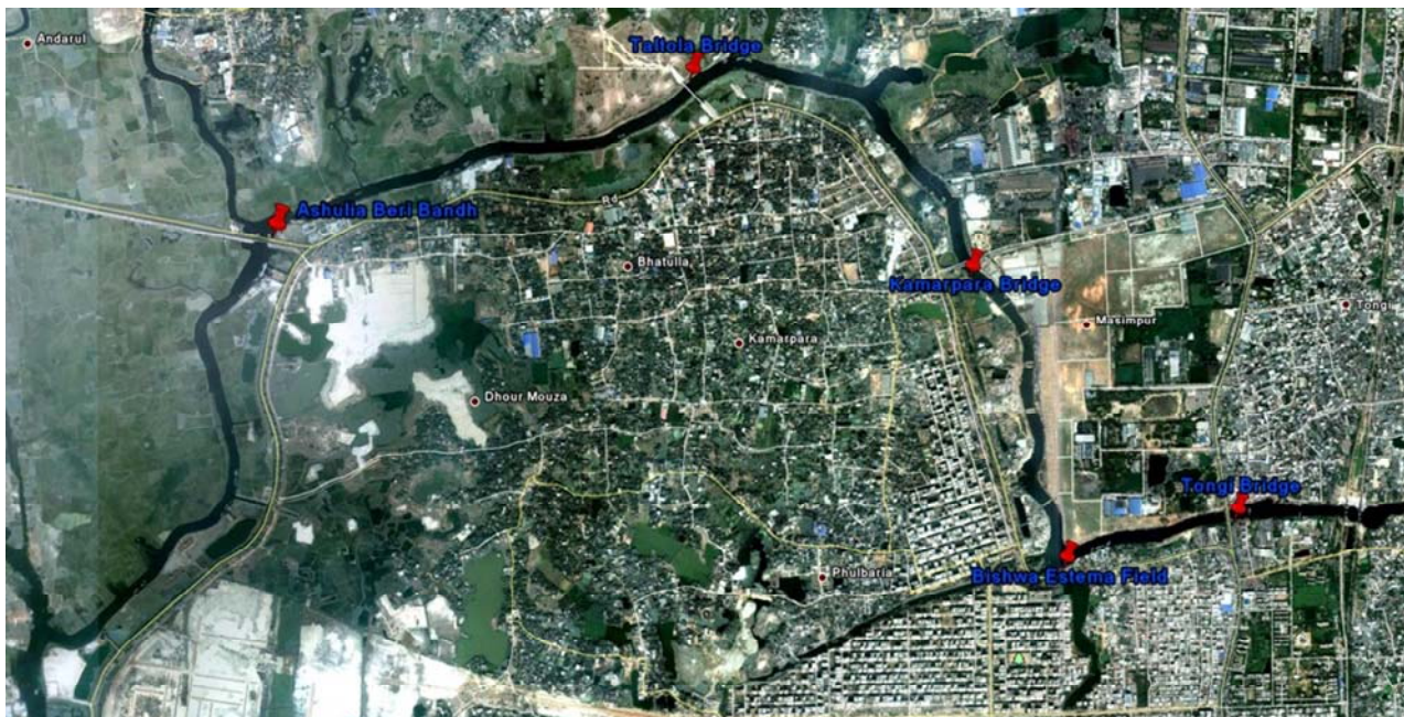
Figure 2. Location of coordinates of different sites in Turag river.