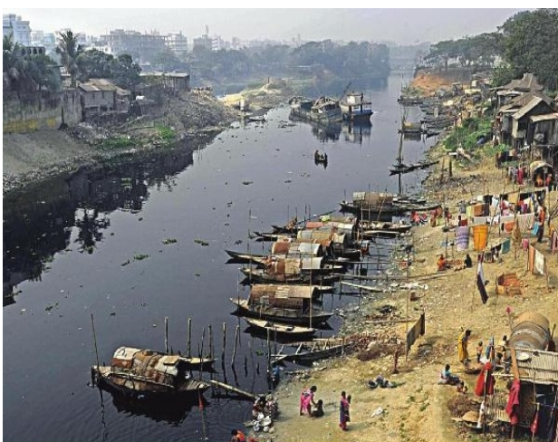
Figure 5. Pitch black water of Turag river, the west of Tongi Bridge, Dhaka, Bangladesh.