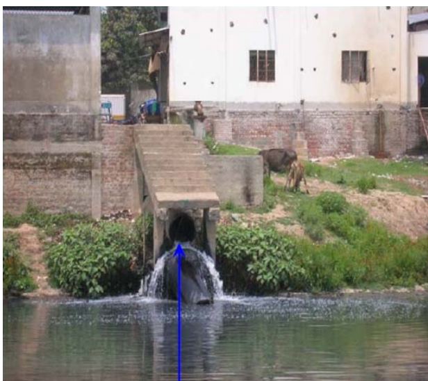
Figure 4. Industrial wastewater discharge in Turag river.