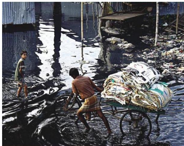
Figure 6. Pitch black water discharges from textile dyeing units in low deep canal that link with Turag river.