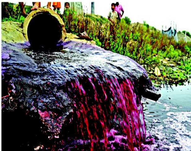
Figure 3. Textile wastewater discharge in Turag river.