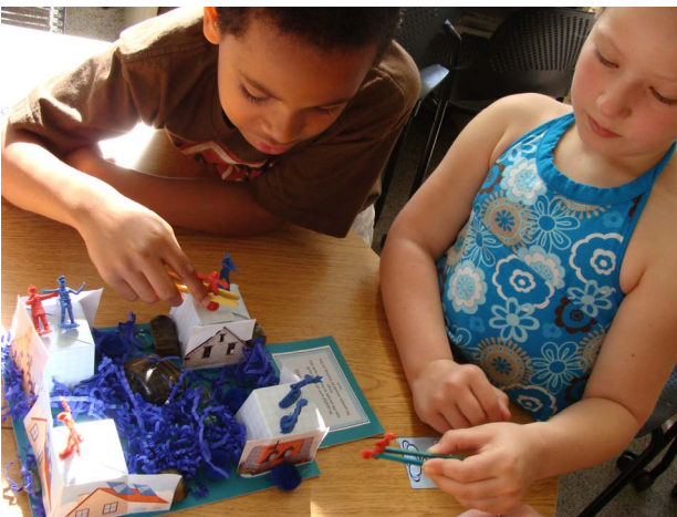
Figure 3. Fine motor skills game flood rescue game made by second grade students.