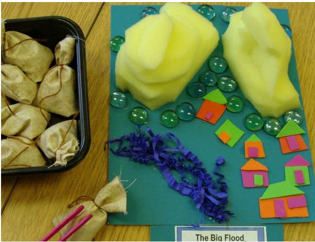
Figure 2. The big flood fine motor skills sandbagging game.