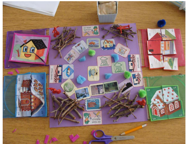
Figure 4. Game Combining Fractions in Rebuilding Flood-Damaged Homes.