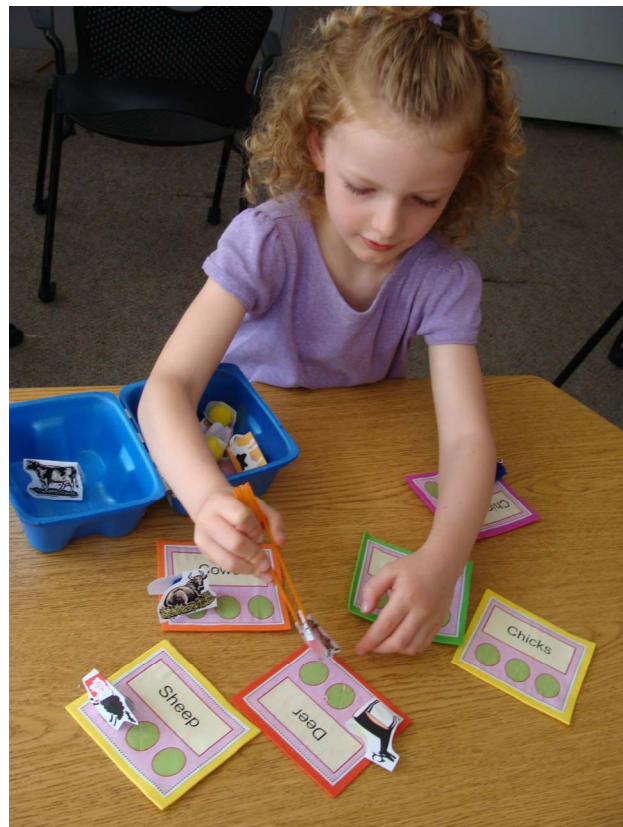
Figure 1. Fine motor skills game of rescuing and sorting animals made by first grade student.

A word find, made by a kindergarten student, focused on new flood-related vocabulary, such as mudflow , jumble ice , and debris . Words were printed backwards and on diagonals with other non-related words (e.g., happy, joy, sweet) used to fill space and make it more entertaining. Clues for the words were complex and attempted to direct the player to a certain place of the board.