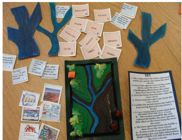
Figure 5. Topographic Contour Map Game of Rising and Falling River Levels.

second and third graders combined fractions with house-rebuilding in a cooperative format of moving around a board, landing on spaces, and giving fractional house pieces to flood victims attempting to rebuild their homes. See Figure 4 .