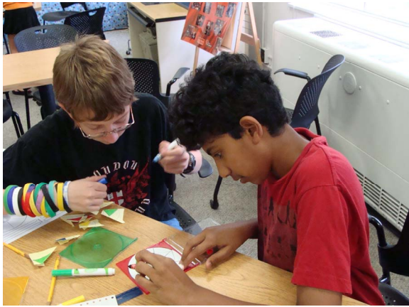
Figure 6. Two middle school students working on a fact puzzle game made from a compact disk and its case.