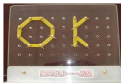
Figure 4. Screen figures.