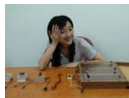
Figure 9. Linking Circuits.