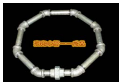
Figure 3. Mike pipes.