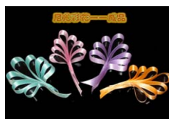
Figure 6. Folding ribbons into flowers.