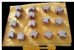
Figure 1. Dovetail blocks.