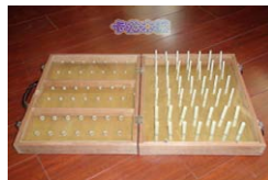
Figure 2. Carron stakes.