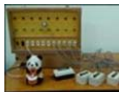
Figure 7. Morgan Lantern.

First step: Field test. This was tested in a one-on-one environment with one participant and one trial staff member. At the beginning of each test, a video was played to demonstrate the testing process; participants were reminded to watch the video. They were required after the end of the video guide to complete the operation task and click on the computer program to begin the test. The main trial began as soon as the “Start” button was clicked on and once the participant completed the test, the main trial was required to press the end button to stop the timer. The