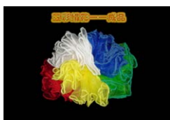
Figure 5. Colourful silk flowers.