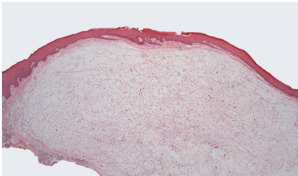
Figure 2. Photomicrograph showing oral epithelium and a well-demarcated but not encapsulated area of myxoid tissue (Hematoxylin and eosin—25×).