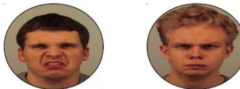
Figure 2. Pictures of “Disgusted” (left) and “Angry” (right) emotional faces as they were presented.