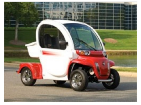
Figure 1 The GEM e2, an example of an LSV.