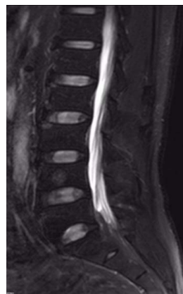
Figure 7. Sagittal SPAIR image of sine.

Figures 7 and 8 SPAIR does better in the spine imaging, especially in the spinal cord imaging .SPAIR brings higher quality picture with better SNR and less spinal cord artifact. Figure 8 clearly shows vertebral body contusion with prominent high signal.