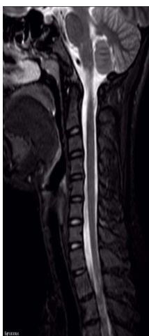
Figure 6. Sagittal STIR image of spine.

compression fracture or chronic, and in detecting the occult fractures.