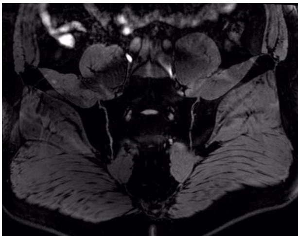
Figure 9. Axial WATS image of sacroiliac joint.

of cartilage volume and thickness ,and the measuring value is close to actual thickness.