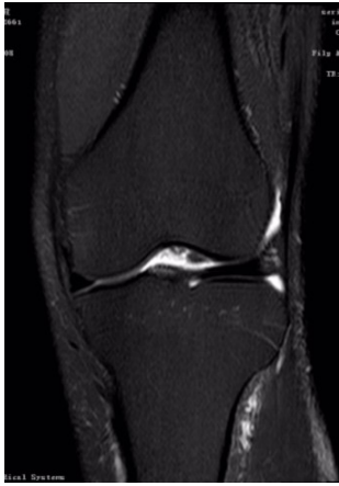
Figure 1. Coronal T2-FS MRI image of knee joint.