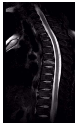
Figure 8. Sagittal SPAIR image of spine.