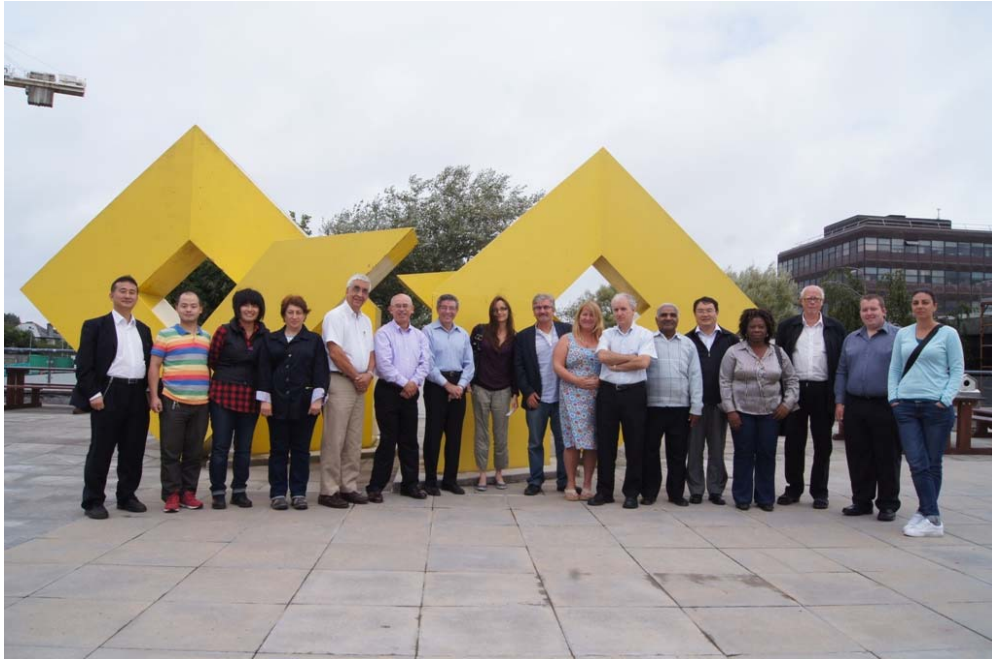
Participants of pre-conference Medical Geology Short Course