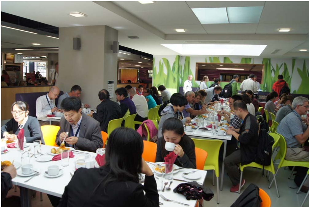
SESEH 2012 delegates enjoy hot lunches in the restaurant