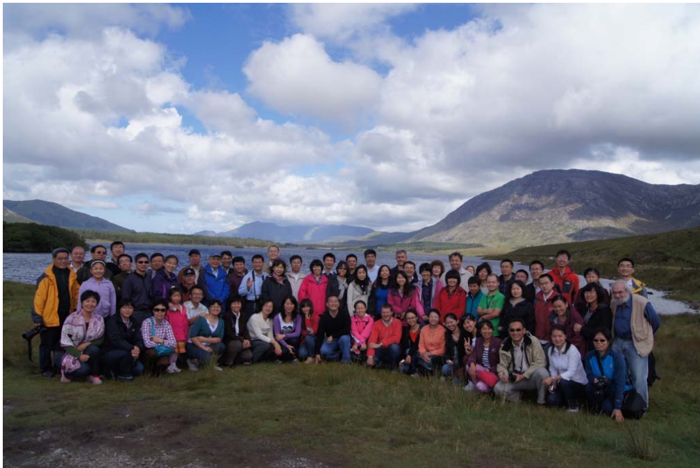
Fieldtrip to Connemara and Kylemore Abbey