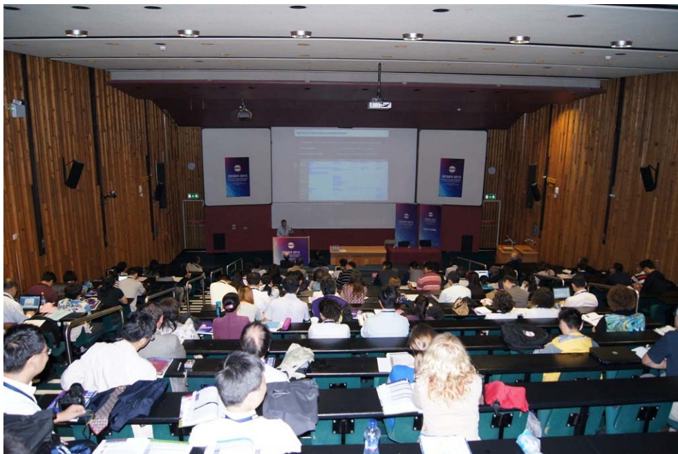
Keynote speech in O'Flaherty Theatre

SESEH 2012 has attracted a total number of 212 participants from China, Europe and the rest of the world