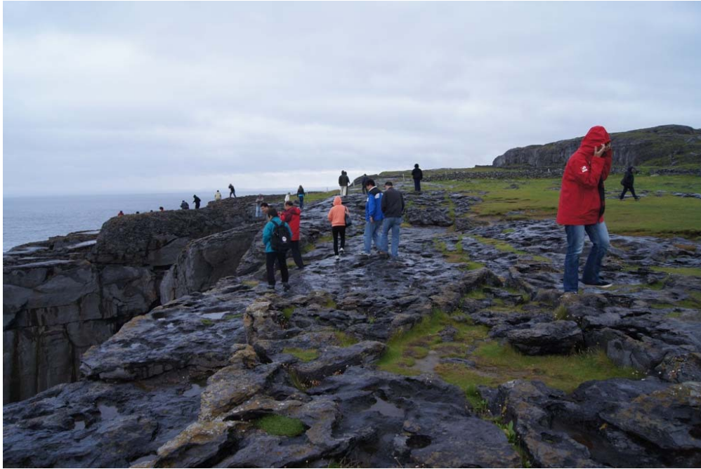
Fieldtrip to the Burren and Cliffs of Moher