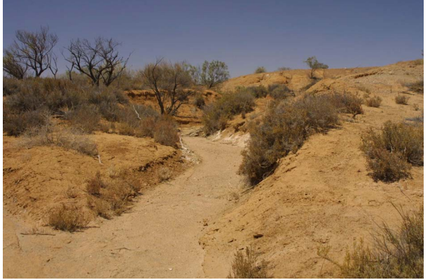
Figure 3: Small fluvial channel incising and eroding into gibber plain adjacent to the main channel.