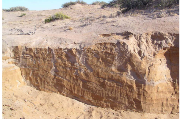
Figure 4: Remnant Aeolian dune crosscut showing air escape structures (pale sands) in an otherwise mudcemented dune. Mud cement most likely due to turbid floodwaters infiltrating dune under hydrostatic pressure.