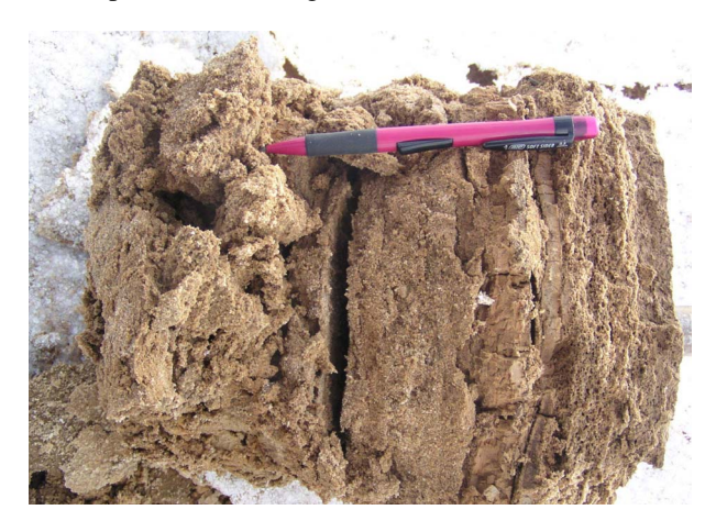
Figure 9: Parallel laminations of mud, silt and fine- Figure 10: Aerial photo of the Umbum Delta. grained sands on the delta front.