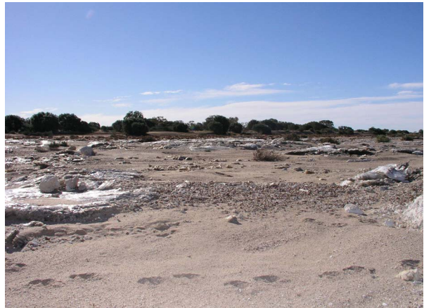
Figure 6: Superman's Palace, an informal name for this site where the top of the Etadunna Formation outcrops in the base of the Umbum Creek channel, forming an erosionally-resistant substrate and the next nick-point downstream of the Umbum Crossing. gypsum crystals of up to several metres across, celestite and palygorskite all outcrop and the assemblage of mineral is indicative of a drying-up, sulphate-rich, alkaline lake.