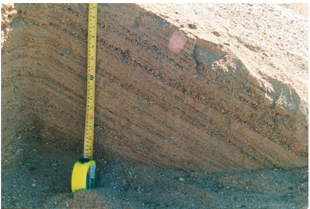
Figure 8: Internal bedding of avalanche front crossstratified beds.