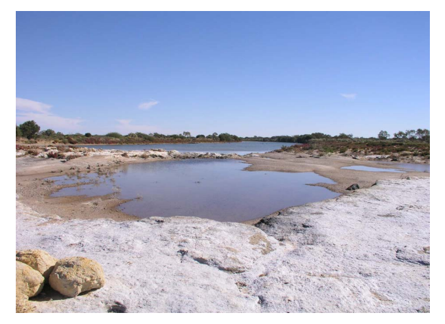
Figure 5: Looking upstream of the Umbum Crossing floodwaters dam against outcrop of Eyre Formation. The outcrop provides a more erosionally resistant substrate in the creek bed and forms a nick point in the fluvial profile.