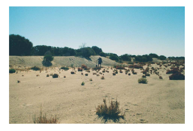
Figure 7: > 1 m high avalanche front cross-stratified simple barforms exit the end of chute channels that cut across points bars during elevated flood levels.