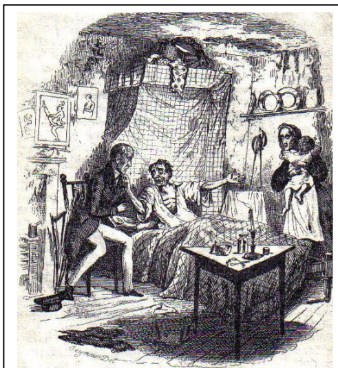
Fig. 1 Robert Seymour, 'The Dying Clown'. The Posthumous Papers of the Pickwick Club (1836-37).

was fond of hot punch — I venture to say he was very fond of hot punch... He ordered another tumbler, and then another — I am not quite certain whether he didn't order another after that [...] he emptied the fourth tumbler of punch and ordered a fifth ( PP 181-182, Dickens's emphasis).