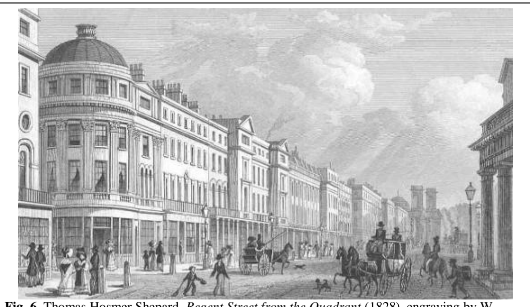
Fig. 6 , Thomas Hosmer Shepard, Regent Street from the Quadrant (1828), engraving by W. Tombleson, 140 x 203 mm.

Claudet's 'Temple', as its name suggested, was to be part spectacle and part mythology, participating in the splendour of the neighbourhood as a platform for pageantry, exaltation and not a little idolatry. 'It's a veritable Pantheon of photography', exclaimed La Lumière 's editor-in-chief, Ernest Lacan in 1855. 'It's