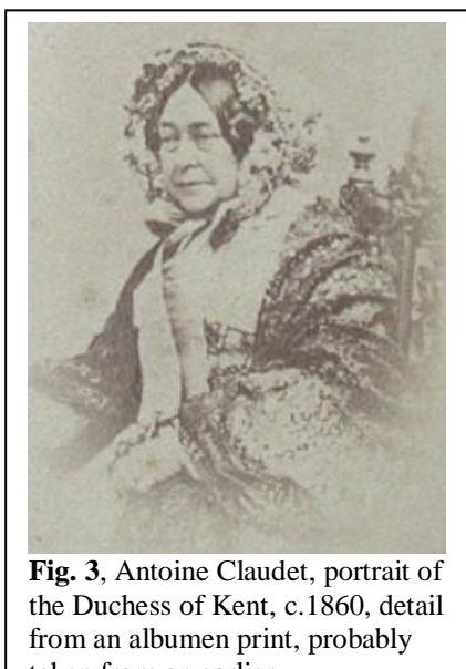
taken from an earlier daguerreotype, 84 x 54 mm.

situation for a likeness', he explained, 'but [...] a little room with blue glass windows is [also] provided' near 'the laboratory [...] illuminated by red and yellow glass'. 'The plate goes here after the likeness is taken, merely for the purpose of being washed, etc.', the reporter assured.<sup>25</sup> Despite the article's positive tone, particularly in noting the recent visit of Queen Victoria's mother, the Duchess of Kent (see fig. 3), and Claudet's display opera portraits, concrete signs of the of convenience, comfort and elegance mentioned in the advertisements were meagre at best. In such limited quarters, there was little possibility of