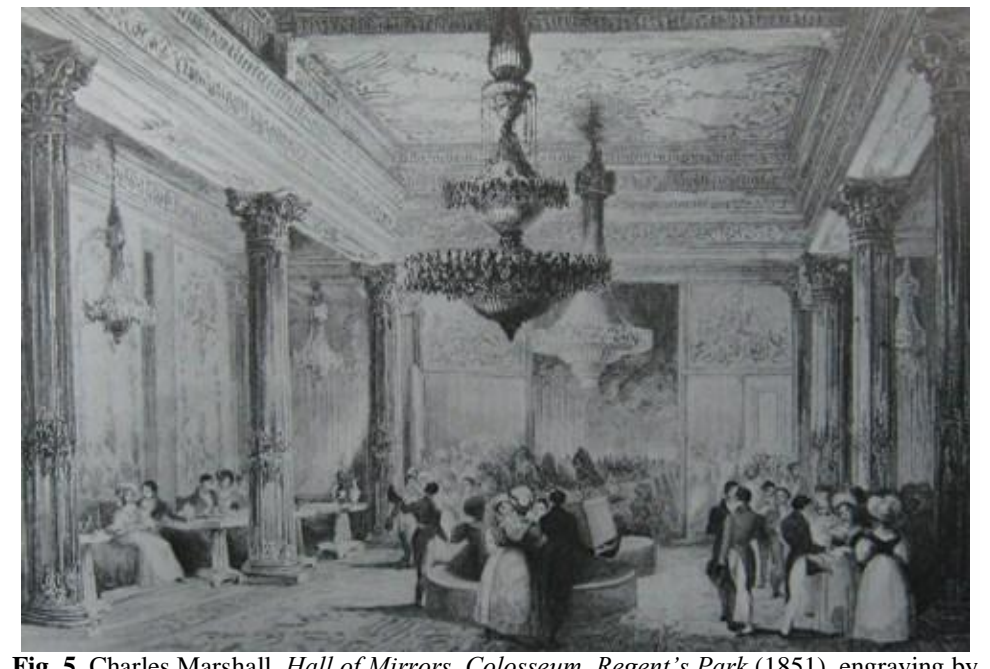
Fig. 5 , Charles Marshall, Hall of Mirrors, Colosseum, Regent's Park (1851), engraving by Thomas Turnbull, 115 x 140 mm.

on 5 April 1847 in the Colosseum, a leisure attraction on the southeast edge of Regent's Park near the Diorama, the light-and-shadow show owned by the daguerreotype's co-inventor, Louis Jacques Mandé Daguerre. Regent's Park had become the playground of the upper class, where 'the rich, with horse and carriage, ride along the vast lawns', according to French photography critic Francis Wey.<sup>32</sup> The imposing neo-classical Colosseum opened in 1829 as a gathering place for the well-to-do ( see fig. 5 ). Intended to offer 'the advantages of a club-house in town with the attractions of a rural villa',<sup>33</sup> it was a moneymaking venture best known for its enormous panorama of the London skyline.<sup>34</sup> The attendant four acres of manicured gardens recalled the popular Vauxhall Gardens, with rows of tall trees and strategically placed mirrors to block out the city and offer visitors a sense of endless open space.<sup>35</sup>