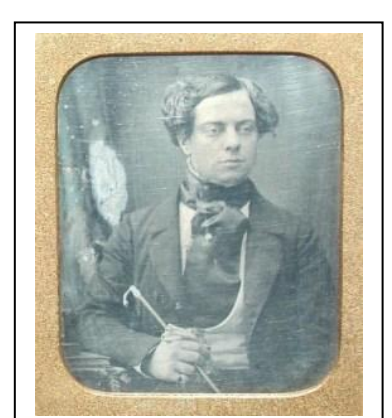
Fig. 1 , Antoine Claudet, portrait of an unidentified man, c. 1845, daguerreotype, 78 x 66 mm.

If this celebrated photography pioneer, who had begun his career as a glass merchant, still maintained the 'fervour' of exploits stretching back nearly to the 1839 announcement of the medium's invention, his success had lain in converting sheer enthusiasm into a sophisticated promotion of photography itself. In particular, the evolution of Claudet's studios in the first two decades of commercial