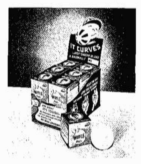
Display card in 3 colors holds 1 doz. Wiffle Balls