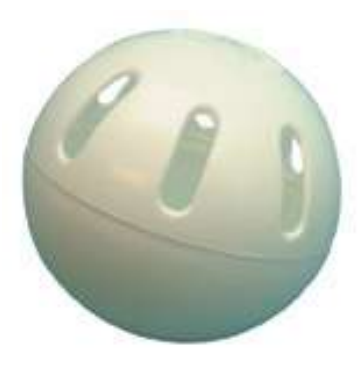
FIGURE 1 The Wiffle® Ball

With one solid side and one side with eight oblong slots carved into it, this ball solved the problem of broken backyard windows and became an American icon.