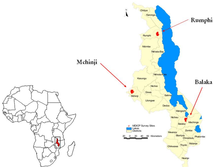
Figure 1: Malawi map with MDICP & MRP research locations highlighted

Drawn from 119 rural villages, the sample includes roughly 1500 ever married women and 1000 of their spouses in each of the interview years (1998, 2001, 2004, and 2006). Researchers have shown favorable evaluation of these data's reliability, attrition, and representativeness (Anglewicz et al. 2009; Bignami-Van Assche, Reniers and Weinreb 2003; Watkins and Warriner 2003; Watkins et al. 2003). Analyses of the MDICP data have been used to describe numerous HIV-related issues in Malawi, such as risk perception (Behrman, Kohler, and Watkins 2007; Bignami-Van Assche et al. 2007; Helleringer and Kohler 2005), related behaviors (Kaler 2004; Trinitapoli and Regnerus 2006), infection rates (Obare 2005; Obare et al. 2008), and care giving (Chimwaza and Watkins 2004).