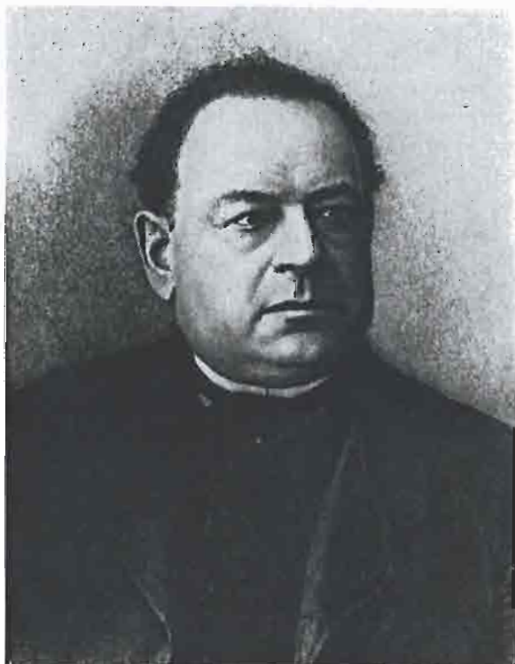
Moritz Hermann von Jacobi 1801-1874

Later in this year Jacobi moved to St Petersburg to take charge of the Physics Laboratory of the Academy of Sciences. Here he continued his work in electrochemistry, and in October 1838 he reported to the Academy of Sciences on his process of "galvanoplastik". This was of course what we now call electroforming, and the first account of this practical application of electrochemistry was briefly noted in England in The Athenaeum of May 8th, 1839. A detailed account appeared a little later in the form of a letter from Jacobi to Faraday published in the Philosophical Magazine .