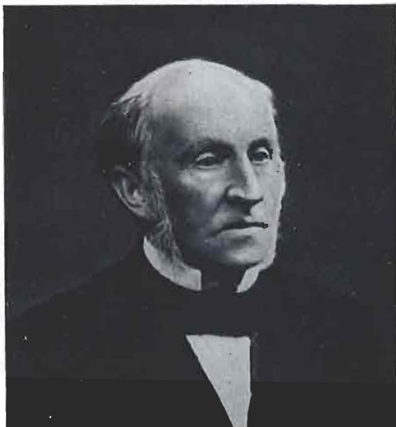
Alexander Parkes 1813 – 1890