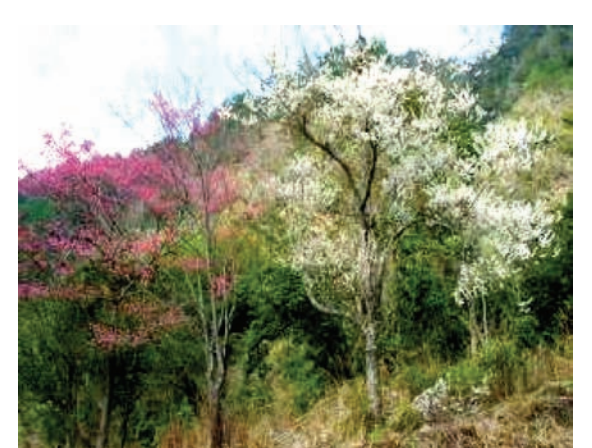
FIGURE 3. Cherry Blossom as an Indicator of Beginning of Growing Millet

The sign for starting growing millet. Tribes and villages vary; take the upstream village of Llyung Papak (the watershed of Papak ) as an example. Village inhabitants usually use the time at which the cherry trees in Tanan Sayun (a place name) blossom as the time for the millet seeding ceremony. Figure 3 shows that the sight of red and white buds signals the start of the millet-seeding season, which ends when the cherry blossoms fall. According to the elders, if seeded after the cherry blossoms fall, the millet harvest would be poor due to fierce storms.