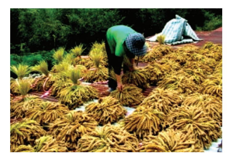
FIGURE 10: Millet Drying

"When the sun shines on the land, the harvested millet should be dried under the sun. Both sides of each tassel need to be dried for three days. Until millet are thoroughly dried, each tassel has to be rearranged."