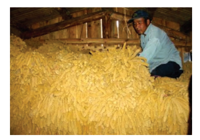
FIGURE 12: Millet Storage

"After drying and cleaning the millet, we store the stalks in bundles in the barn, and will call the production work finished."