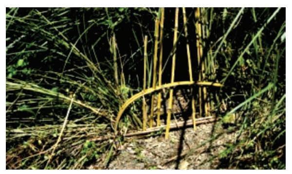
FIGURE 7. The Trap to Catch Rats That Might Eat Millet

"When the millet begins to tassel, we know the reaping season is coming soon. To prevent animals such as Red-bellied Squirrels, the Formosan Striped Squirrel, Spinou Country Rat, and others from eating the millet, we set up traps around the millet fields."