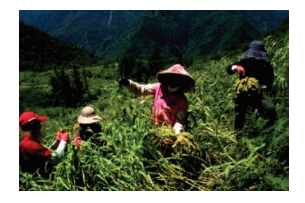
FIGURE 9. Millet Harvesting