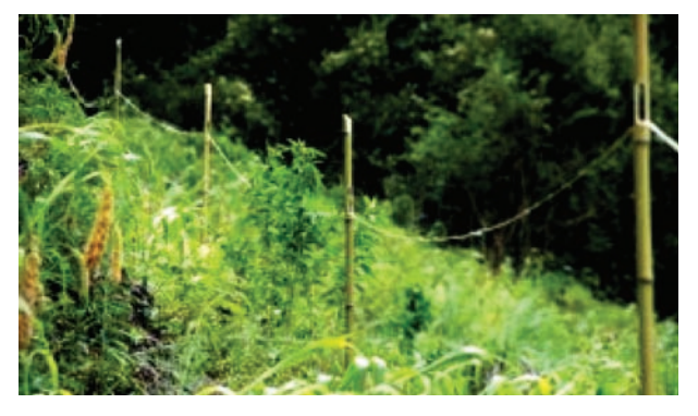
FIGURE 8. The Device to Repel Birds

"Before the millet tassels, we need to set up devices that repel birds around the fields and have people guard the fields so that the birds will not come and eat our crops."