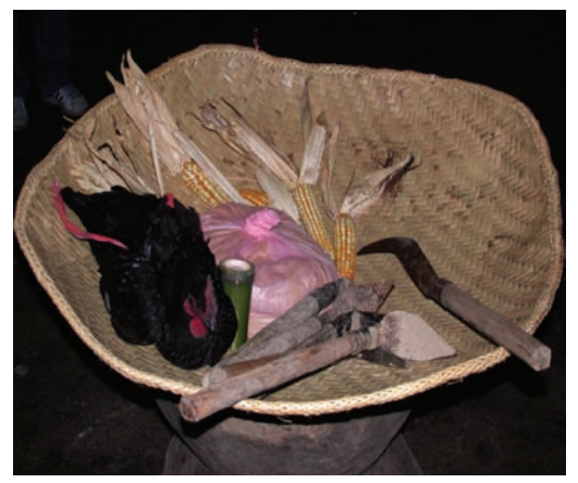
FIGURE 4. The Essential Elements for the Millet Ritual

Tmubux: seeding. Whether the fields are seeded with millet on the next day is determined by a dream divination on the previous evening. Figure 5 shows villagers are seeding in the field. A dream of a river suggests a great millet harvest, whereas a bad dream tells some to seed on another day.