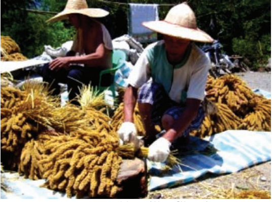
FIGURE 11. Millet Cleaning

"After that, we cut the superfluous stalks that cannot be trodden upon. If you tread upon them, you will get a malignant boil."