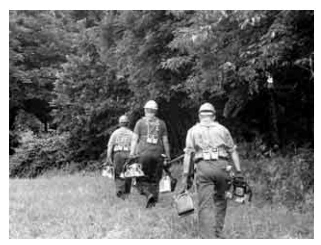
Figure 3 Cutter going to the felling site with driving device on its back Slika 3. Odlazak sjekača u sječinu s pogonskim uređajem na leđima

The research was carried out in the mountainous part of Croatia (Litorić, Gorski Kotar) as shown in Figure 2 at an altitude of 750 m. The compartment is of an area of 22.77 ha with 70 % coverage. This stand is made of fir and beech with a total growing stock of 306 m<sup>3</sup>/ha of which fir accounts for 48.4 %, beech for 39.1 % and other hard-wood broadleaved species for 12.5 %. In the compartment 465 trees were marked for felling with a mean volume of 1.71 m<sup>3</sup>, and the mean volume of fir was 1.81 m<sup>3</sup>.