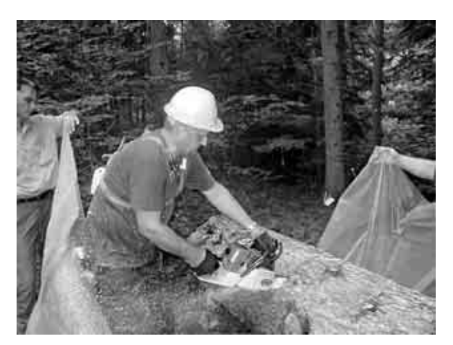
Figure 1 Cutter with attached dust samplers Slika 1. Sjekač s pričvršćenim uređajima za skupljanje uzoraka prašine

The mass concentration of respirable particles and total dust were determined by gravimetric method in compliance with the standard ZH 1/120.41, 1989, by use of personal collectors defined by the standard EN ISO 10882-1:2001. Personal collectors manufactured by Casella (produced in Bedford, UK, 2001) were fixed by straps on the cutter's body so that the suction parts, cyclones equipped with filters were positioned in the breathing zone (Figure 1), and the driving device (electric pump) on its back (Figure 3), so as not to stand in the way of cutting and processing. The separators of non-respirable particle fraction (cyclons) operate in a way similar to the separation of respirable particles in the medium effective (50 %) respiratory system of a healthy adult, with an aerodynamic diameter of 5 µm. The measurement was performed by use of a micro-scale METTLER-TOLEDO MX-5 (produced in Greifensee, Switzerland, 2000) capable of precise measurement and reading of values to 10<sup>-6</sup> gram, with measurement error of \pm 10^{-4} gram. In the process of sampling, the air flow rate at the suction head was 2 L/min (EN ISO 10882–1:2001).