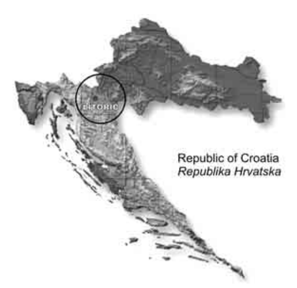
Figure 2 Site of research Slika 2. Prikaz mjesta istraživanja

Research of fir-wood dust concentration in the working environment of cutters (85-90)