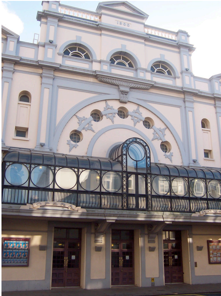
Figure 2 -The front façade of the Jersey Opera House

Jersey has a rich cultural scene, being well-served by a number of arts and cultural associations. The Jersey Arts Centre provides a theatre space, a gallery and workshop rooms. The Jersey Opera House, meanwhile, provides another theatrical space and is used by larger scale local and touring productions. There are also a number of local amateur theatre companies, orchestras and dance schools as well as professional artists working in the Island. It is estimated that there are 46 bodies dedicated to ‘cultural activity’ in Jersey, with between one in six and one in ten of the population actively involved in the arts (Burns and Middleton, 2000: 52). Jersey’s heritage is also well represented, with the Jersey Heritage Trust, the Société Jersiaise and the National Trust for Jersey looking after historically and ecologically important sites. A summary of Jersey’s principal cultural organisations and their objectives can be found in Appendix 1.