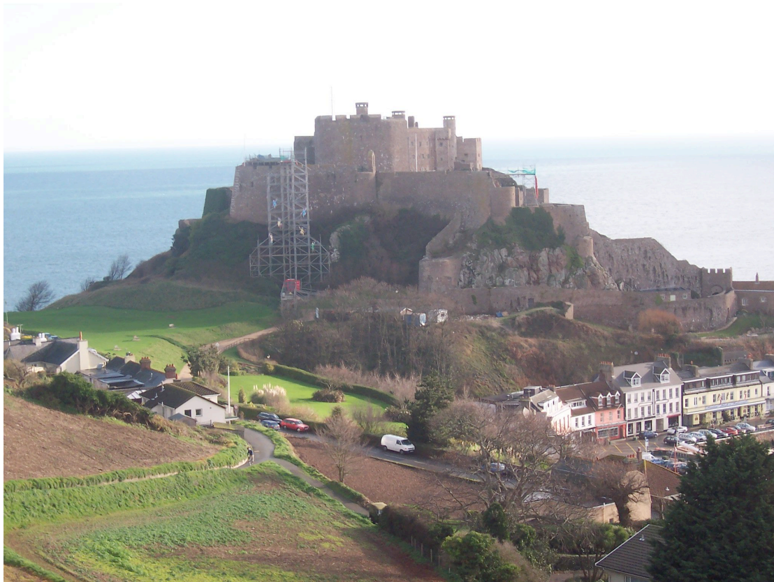
Figure 6 - 13 th century Mont Orgueil Castle, originally built to protect the island against the French, with the Normandy coastline on the horizon

The increased penetration of media and information channels into the Island has brought with it an emphasis on the creative industries and popular culture. A report published by the Jersey Arts Trust states that the creative industries have ‘the potential to make a significant contribution to the economy’ (Feltham, 2004: 12). Encouraging growth of the creative industries will certainly diversify the economy, but it will also open the Island up to a further influx of external cultural symbols.