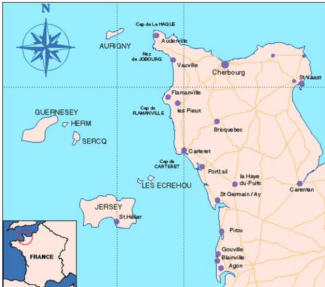
Figure 1 – Map of Jersey and the Channel Islands

Jersey is particularly frustrating. It is a Crown Dependency with a strong sense of its own distinctiveness. It has often behaved as if it were independent, and continues to do so. (Le Rendu, 2004: 10)