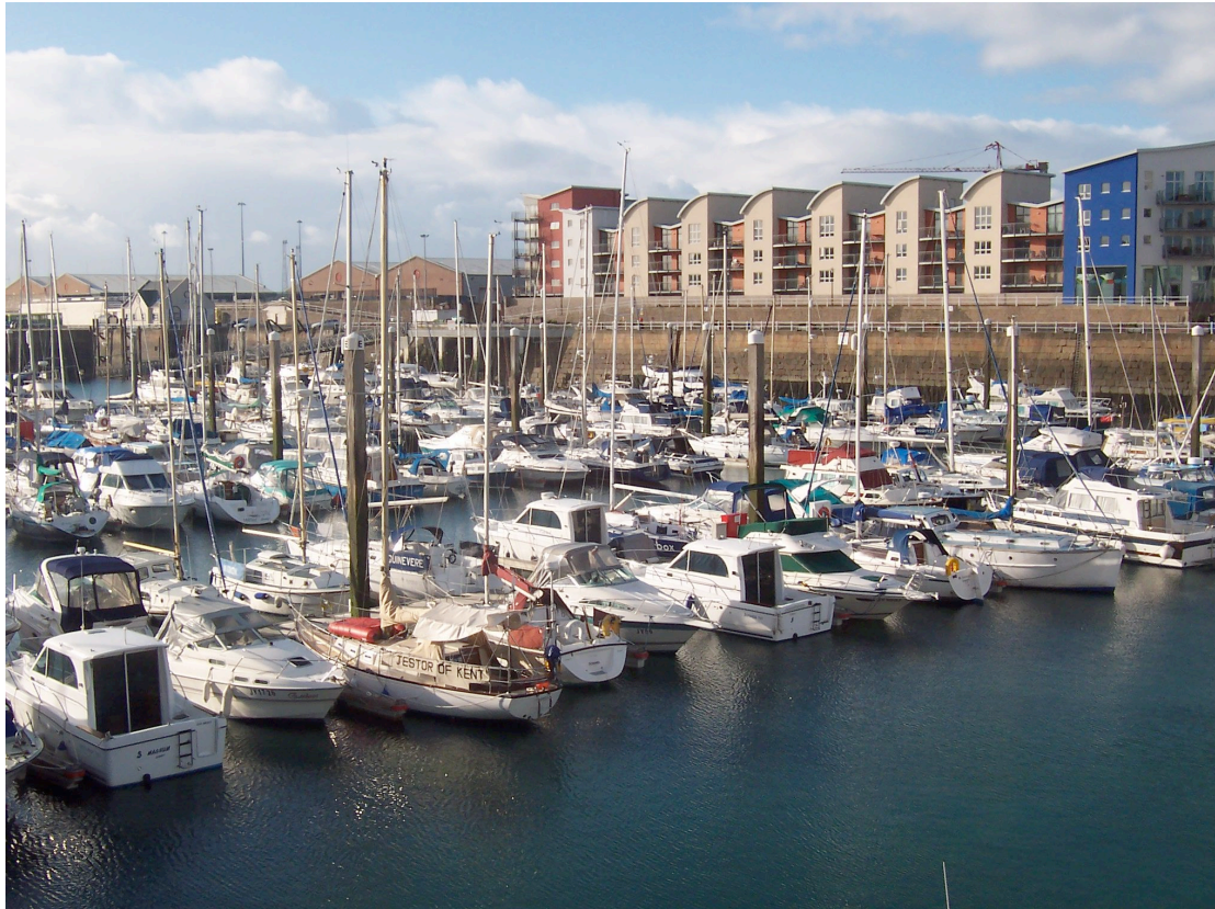
Figure 7 – Jersey’s Waterfront

[Part of Jersey’s Waterfront development, with the recently constructed residential project behind the marina. The proposed 20 storey high-rise development would stand alongside these apartments.]