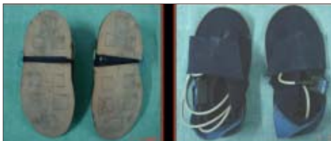
Figure 1: CDG shoes with sensors

CDG Shoes with sensors: CDG shoes are designed to measure and record the normal forces under the foot while walking. Each shoe contains 8-load sensor at the sole. Cable attached to shoes transfers the normal forces data to the ultraflex unit for recording [Figure 1].