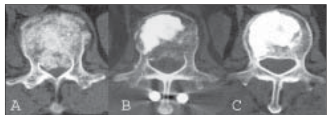
Figure 3: Axial CT scan (A) image shows posterior cortical bone retropulsion. and spinal canal narrowing of 67%. Postoperative Axial CT scan (B) following surgery demonstrating adequate HA graft placement and reduction of the retropulsed bony fragment. Axial CT scan (C) of 2 years after surgery demonstrating further improvement of the spinal canal narrowing and radiographic healing of the vertebral body