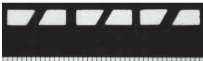
Figure 1: Hydroxyapatite blocks