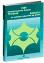
Industrial Commodity Statistics Yearbook 2004