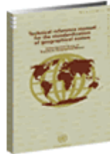
Technical reference manual for the standardization of geographical names

UNSD Questionnaires or Data Requests to be sent to countries (2008 Calendar)