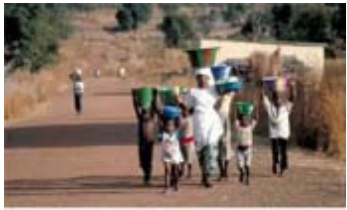
Millennium Development Goals: 2007 Progress Chart

The Millennium Declaration established 2015 as the target date for achieving most of the MDGs, with 1990 generally used as a baseline. The Chart shows progress as of June 2007, based on data for selected indicators in each of the eight Goals. more..