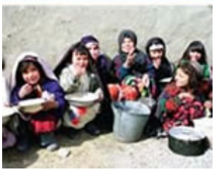
Secretary-General Ban Ki-moon launched the much-

The Statistics Division is committed to the advancement of the global statistical system. We compile and disseminate global statistical information, develop standards and norms for statistical activities, and support countries' efforts to strengthen their national statistical systems. We facilitate the coordination of international statistical activities and support the functioning of the UN Statistical Commission as the apex entity of the global statistical system. For more, see About us .