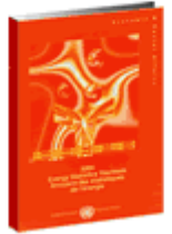
Energy Statistics Yearbook 2004