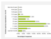
Figure 2. Diagram showing duration of time spent by overseas doctors in the UK. Number of respondents: 1617

The respondents were asked to report the duration of time they had spent in the UK. Twenty five percent had been in the UK for more than 1 year but less than 2 years, 27% had spent 2 to 3 years, 16.5% had been in the UK for 3 to 4 years, 7.1% had spent between 4 and 5 years, 11.3% had spent between 5 and 10 years, and 2% had spent more than 10 years. Those who had spent less than one year in the UK amounted to 11.2% (Figure 2).