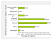
Figure 4. Other Reason for migration to United Kingdom and Great Britain. Number of respondents: 1615. Total number of responses: 2150 (multiple responses were allowed and hence the total adds up to >100%)