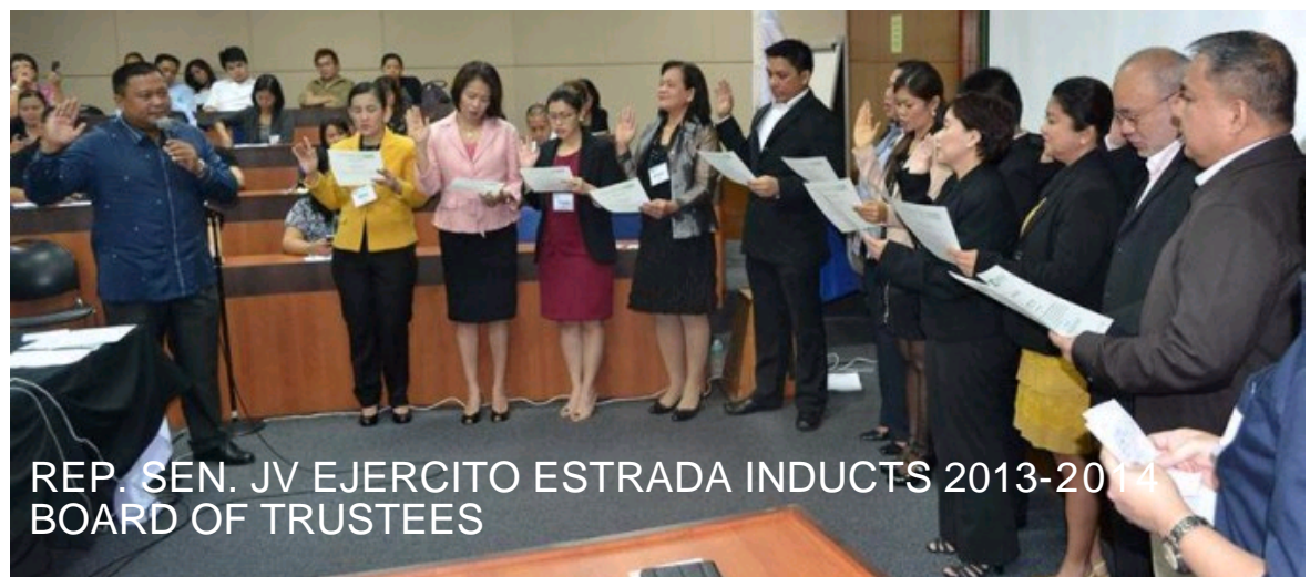
REP. SEN. JV EJERCITO ESTRADA INDUCTS 2013-2014 BOARD OF TRUSTEES