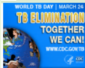
World TB Day 2010