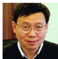
2017 Plenary Speaker Dafang Zhong Shanghai Institute of Materia Medica