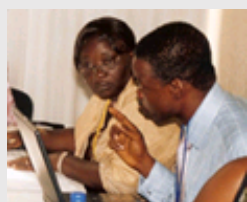
Human rights and gender in HIV-related legal frameworks