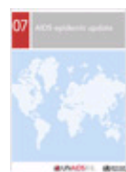
2007 AIDS Epidemic Update