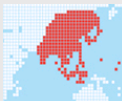
AIDS epidemic update: regional summaries