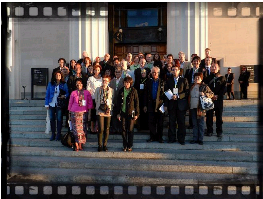
Some of IFLA World Council delegates

v=xKR0PsLR8xk&feature=share&list=PLEoBcmwedS6C66lvzMOcAC2hCMPvvK9rU