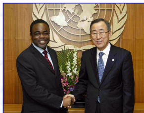
UN Secretary-General Meets UNCCD Executive Secretary

The High-level Policy Dialogue took place on 27 May 2008 in Bonn, Germany. High rank officials met to identify conditions required and political commitment necessary for the implementation of the Ten-Strategic plan and framework to enhance the implementation of the Convention in the context of current global emerging issue more..