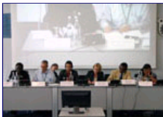
High-level Policy Dialogue

Developed as a result of the Rio Summit, the United Nations Convention to Combat Desertification (UNCCD) is a unique instrument that has brought attention to land degradation in the drylands where exist some of the most vulnerable ecosystems and people in the world. Ten years after its coming into force, the UNCCD operates today in an environment that has evolved considerably since when it was first negotiated more..